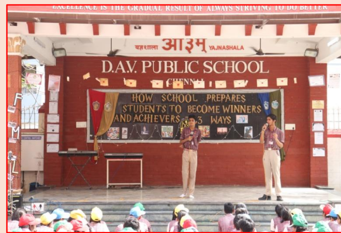
The Speech - Secret of Chambers