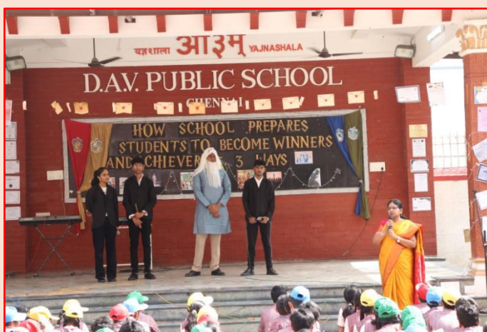
Principal applauds the presentation of the Assembly