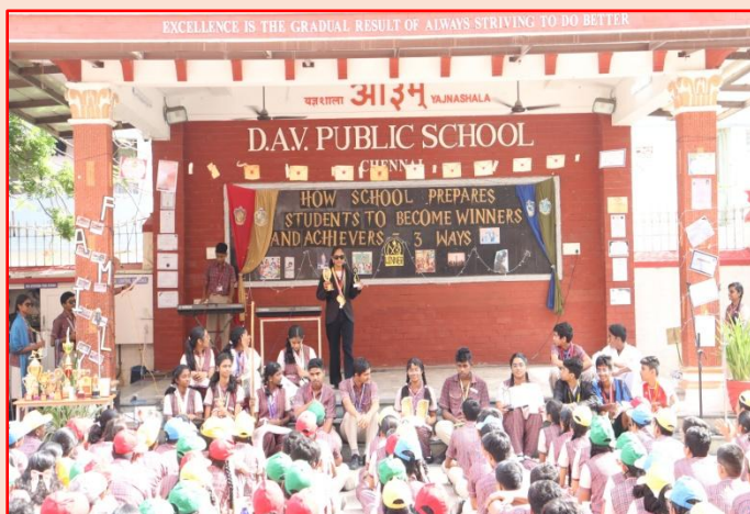
Ramp Walk Show, 'The Runway of Spells'