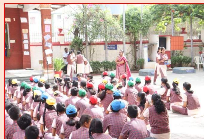
Feedback by Parents about their ward's exhibition of talents