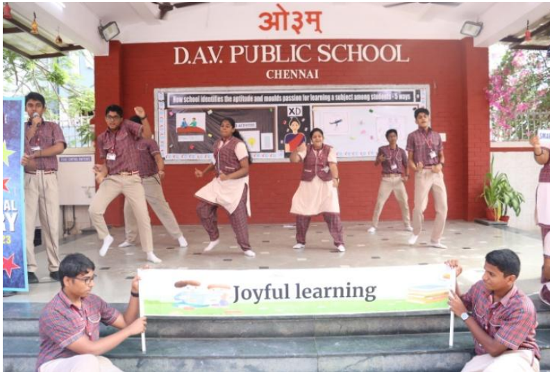
'Joyful Learning' – Scintillating Dance Performance