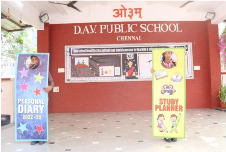
Unveiled Mystery of Diary and Study Planner