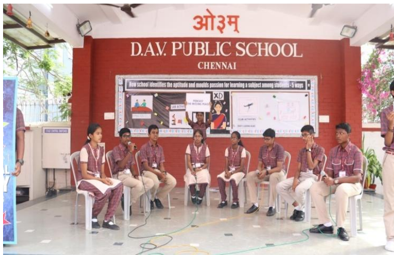
'Exciting Podcast' – An Interactive session on how to create interest towards a Subject