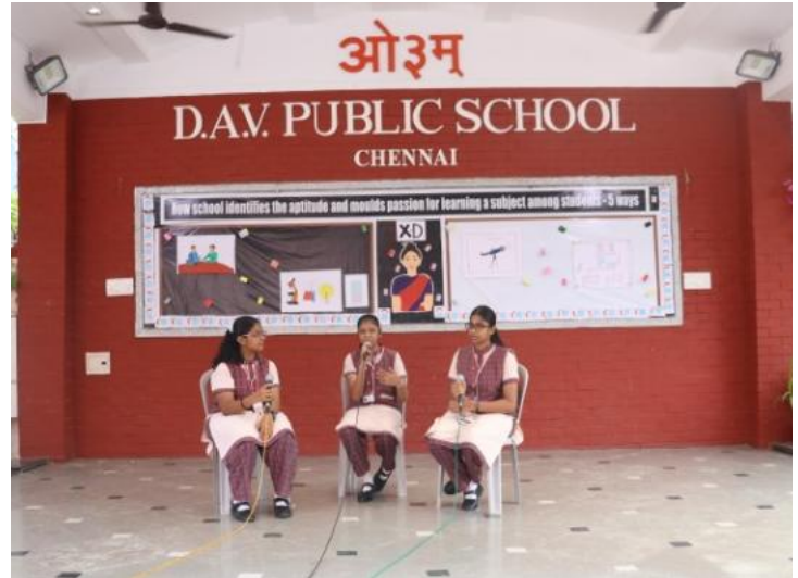
'Enlightening Interview - How School Identifies Aptitude