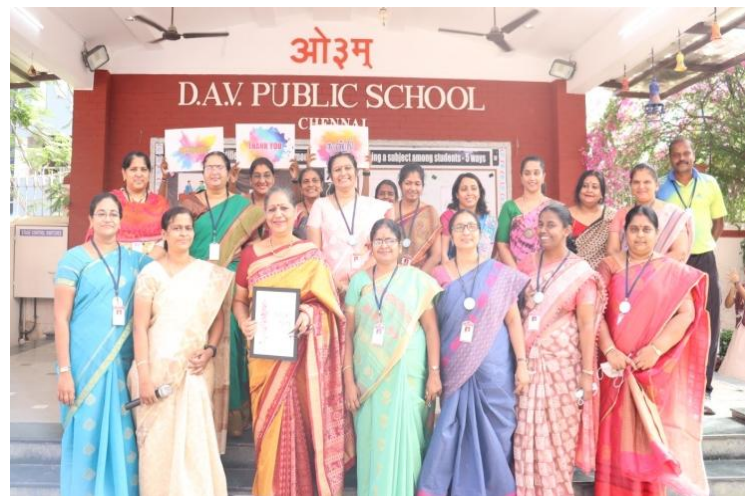
Honouring the Dedicated Team of DAV