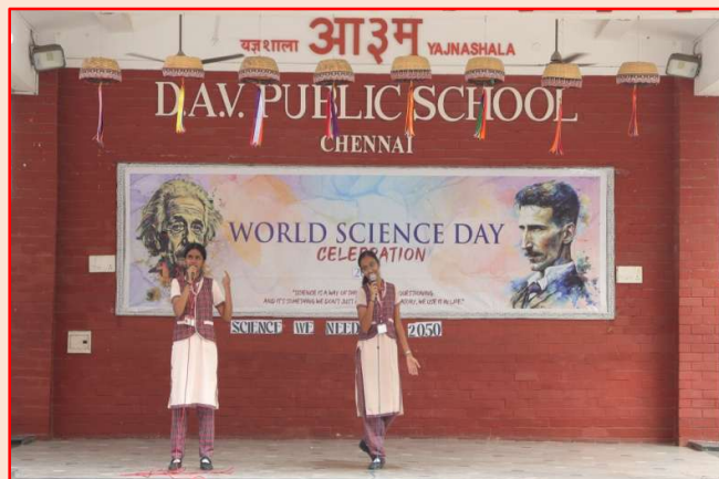
Quiz Blitz for Sparkling Kids