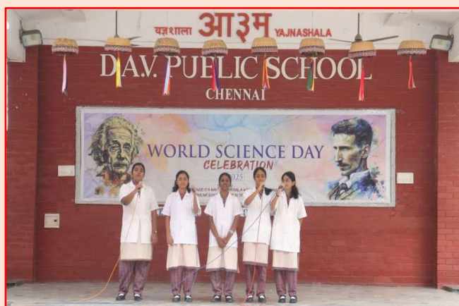
Song on "Trust, Transform and Tomorrow"