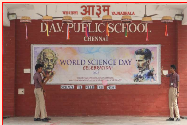
As you sow, so shall you reap