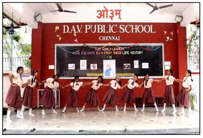
Rhythmic Group Dance on Best Qualities of an Aspiring leaders