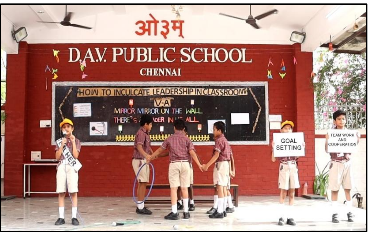
To Instil Leadership qualities through Games and Activities