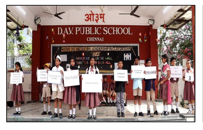
Providing Inspiring Leaders to look up to