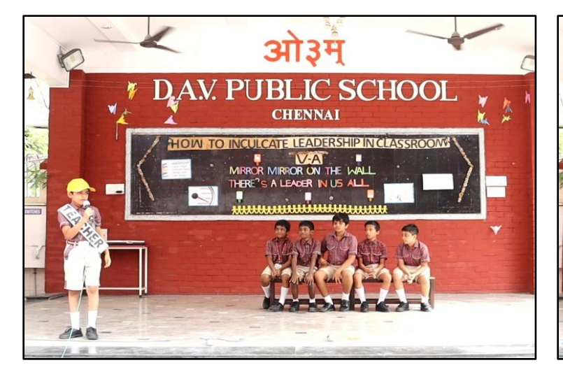
Giving Small Responsibilities