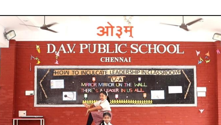
One can Develop Leadership Qualities through Dance