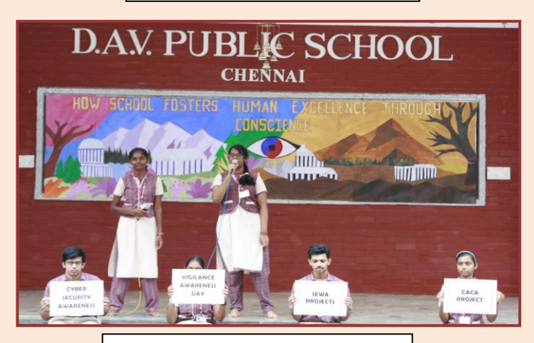
Melody on Conscience