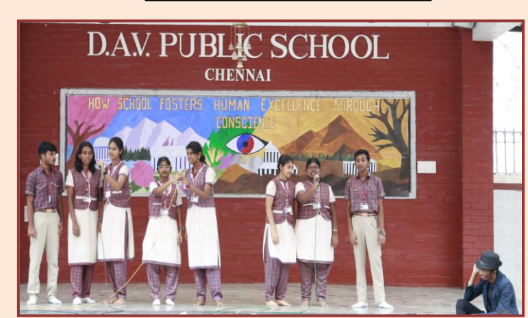
Glimpses of Conscious Acts