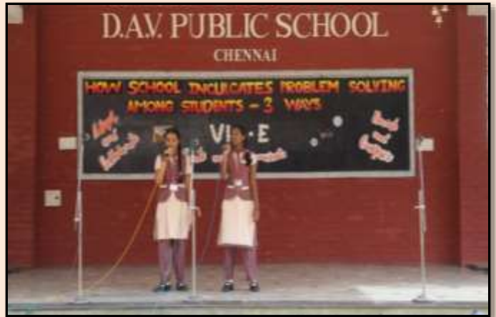
Never give up! – A Motivational Rhythm