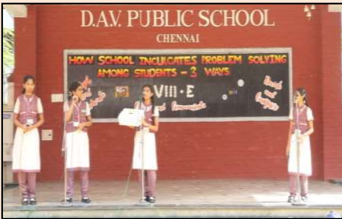
The Magic of Vocabulary Box and Dew Drops of My Diary – An Anthology