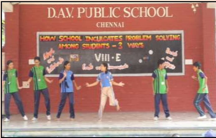
On The Spot 'Decision and Conquer' by the Audience