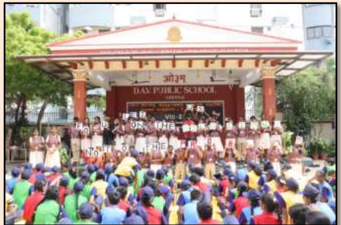
Let us focus on the Solution, not on the Problem!