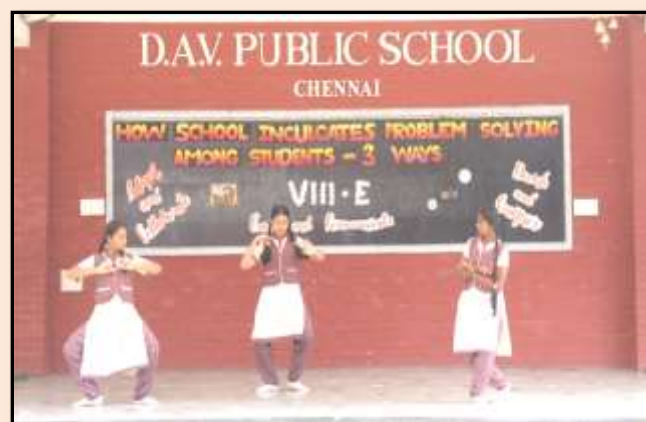
Dance-O-Tune – A scintillating Performance