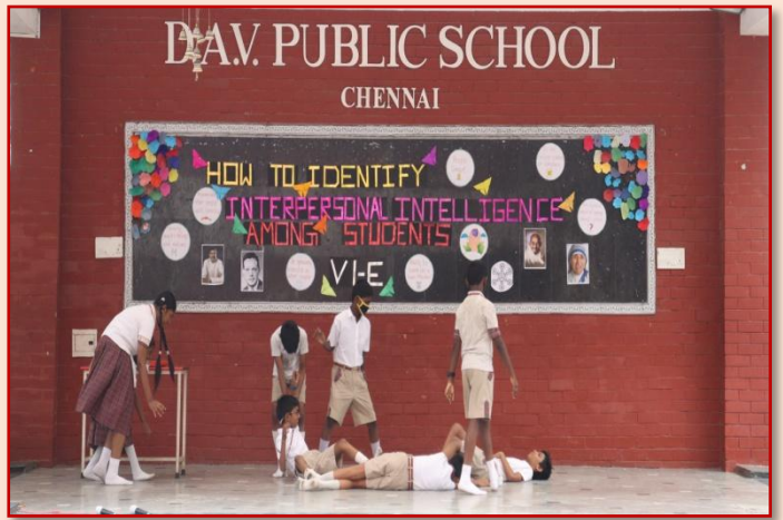
Mime on the Problem of Child Labour