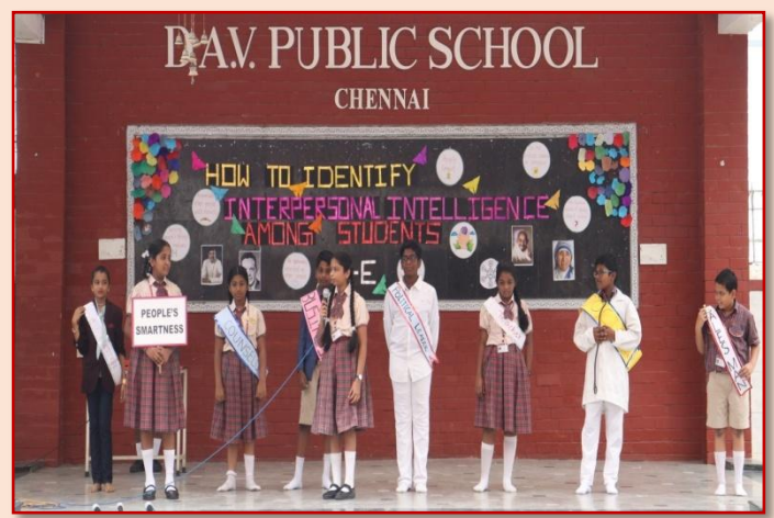
Interpersonal Intelligence in Various Professions