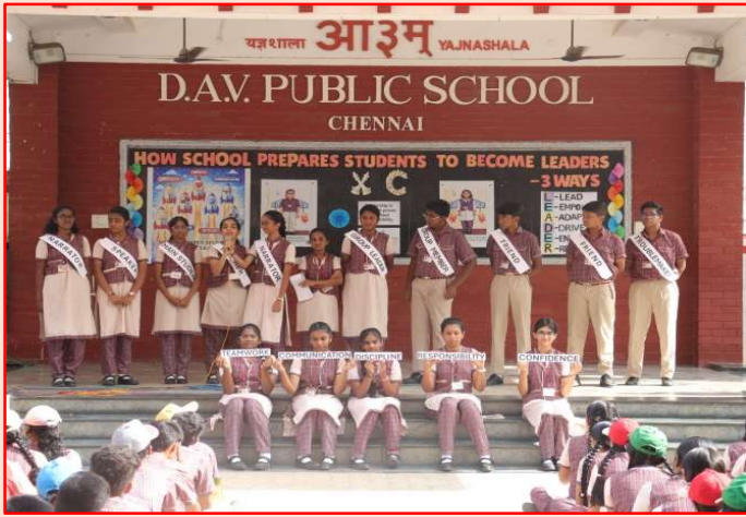
Acting Today, Leading Tomorrow