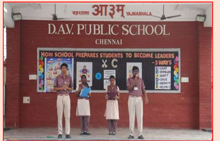
Anchoring the Quiz – Spotlighting Leaders