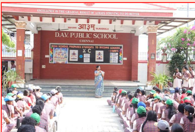
Words of Wisdom – Seeds of Leadership Sown