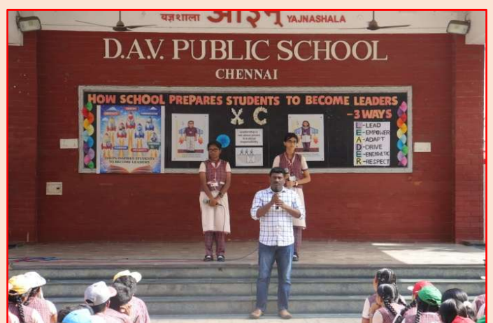
Parents' Verdict – Leaders in the Making