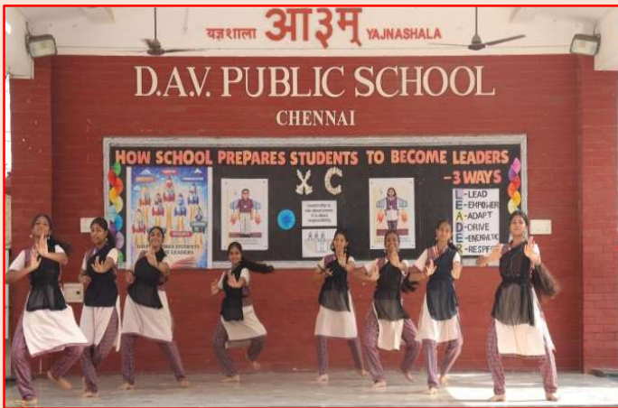
Where Feet Follow Vision