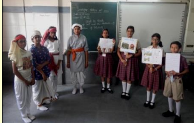
Types of soil and methods of cultivation of different types of millets were well explained