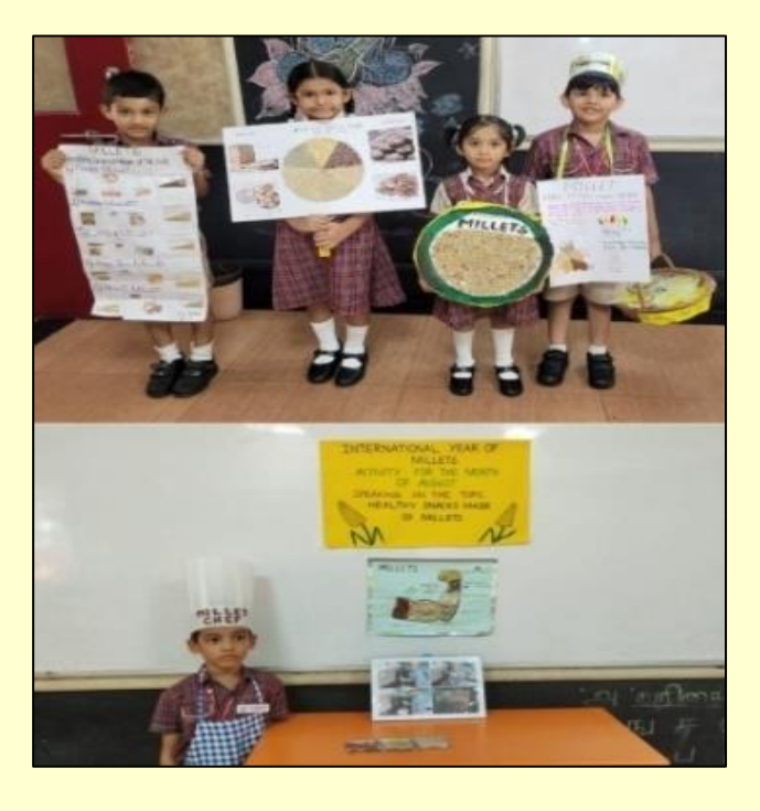
Talk About Millets: Creating Delicious Snacks With Nature's Goodness