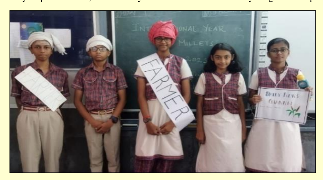
The Ensemble Cast Ready to Perform