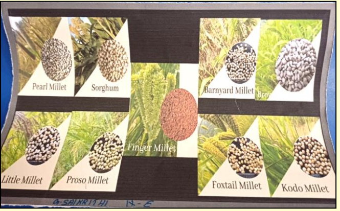
The collage says it all!!