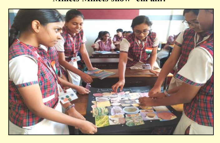
An Insight into Different millets - common and rare!!