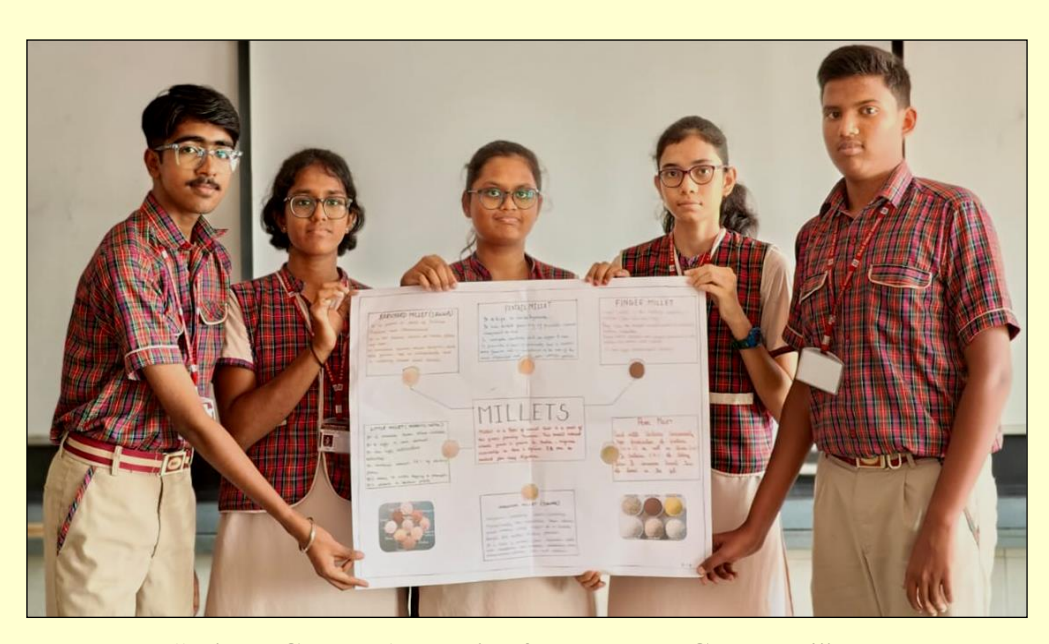
"Millets Galore: A Mosaic of Wholesome Goodness!"