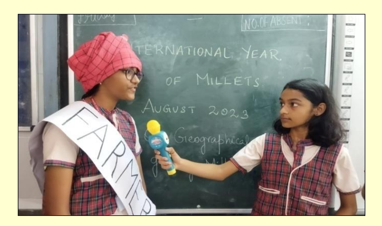
Curious Journalist Questioning a Farmer