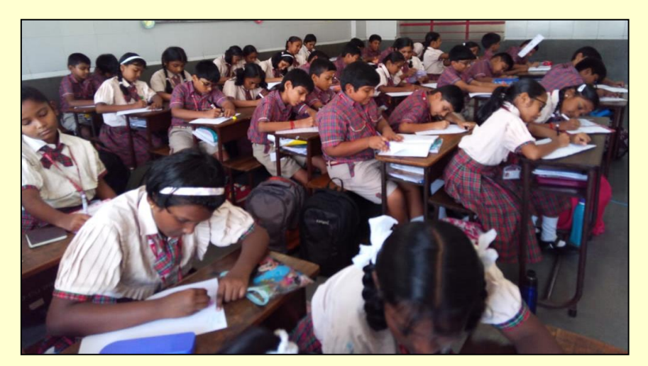
Millet Makeover: Students Elevating Everyday