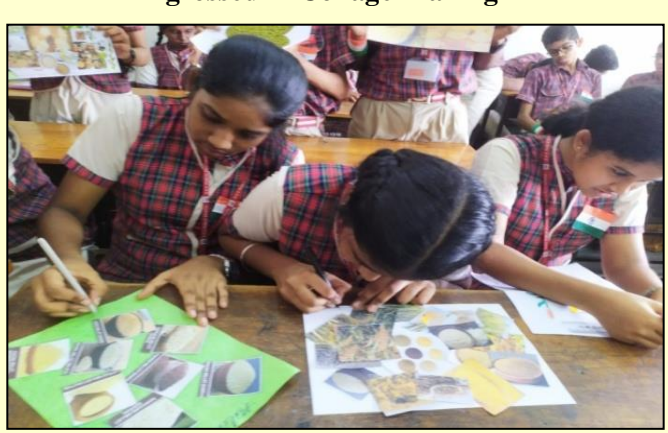
Working with Millets