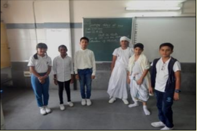
Illustration of the benefits of consuming millets