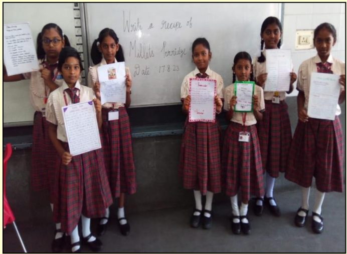
'Taste The Future' with Innovative Millet Recipe Presented by Students