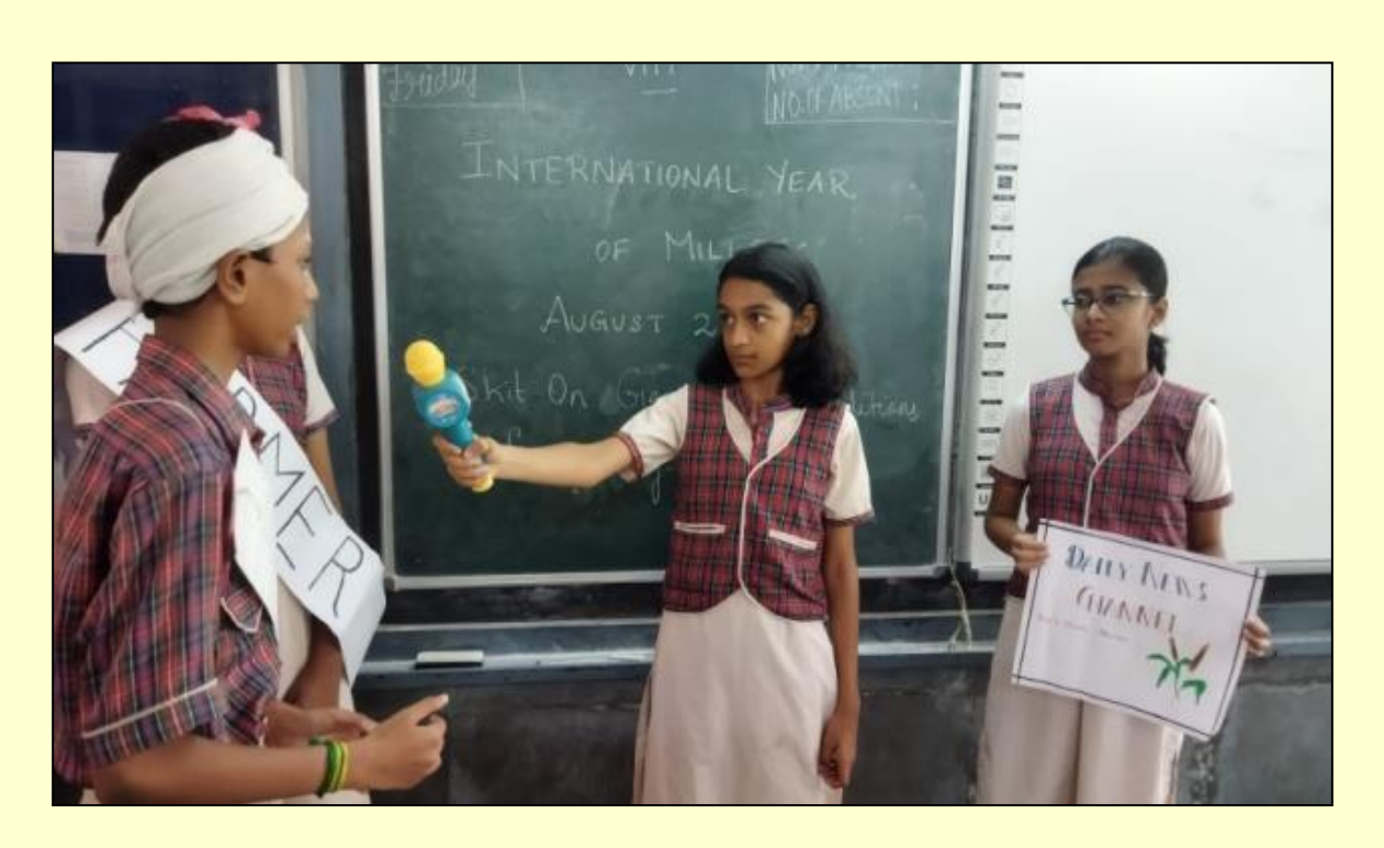
Farmers Expounding on Merits of Millets