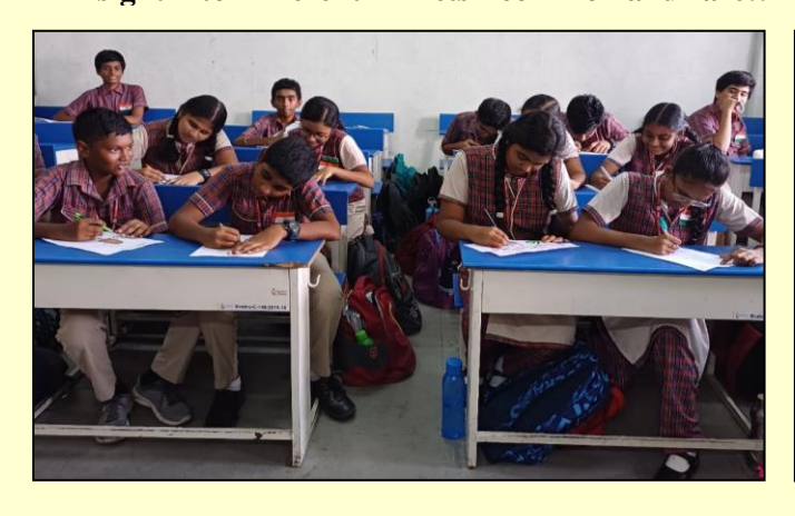
Designing a collage can be fun!!