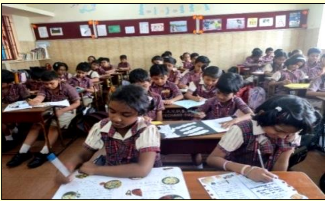
Wholesome Millets Delight: A Culinary Journey to Nutritious Diet