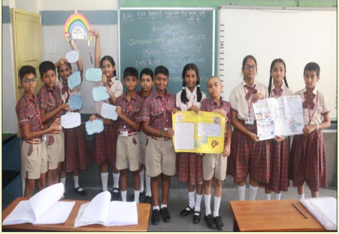
Students of Std. VI convey the message "Be Healthy Have Millets"