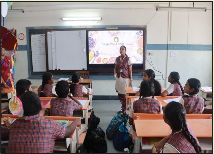
Glimpse of the Presentation of Std. X students on the importance of Millets