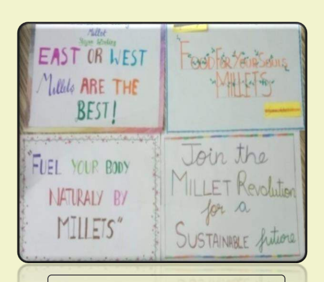
Collage of Candid Slogans