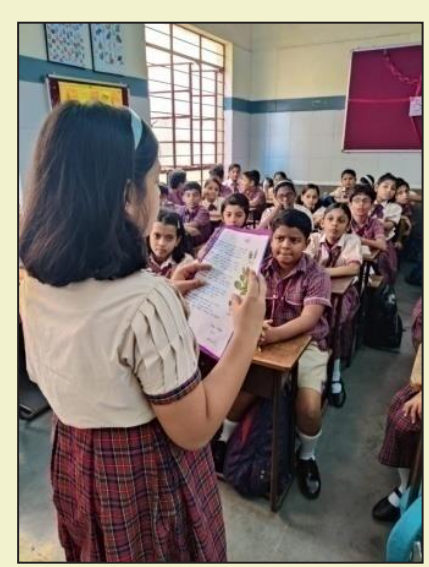
Modern Poetry on Traditional Millets