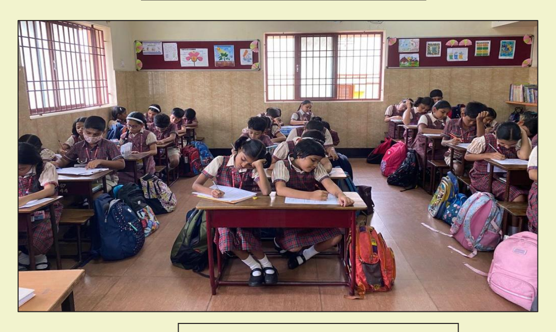
Thinking and Exploring the Puzzle