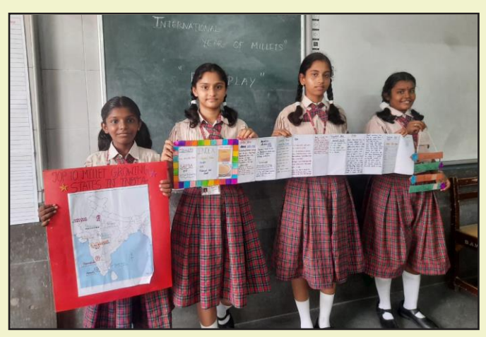
Students of Std. VII convey the message "Be Healthy Have Millets"