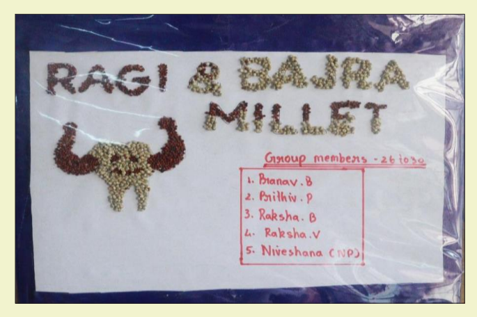
An Introduction by Students of Std. VI with valuable insights about Millets