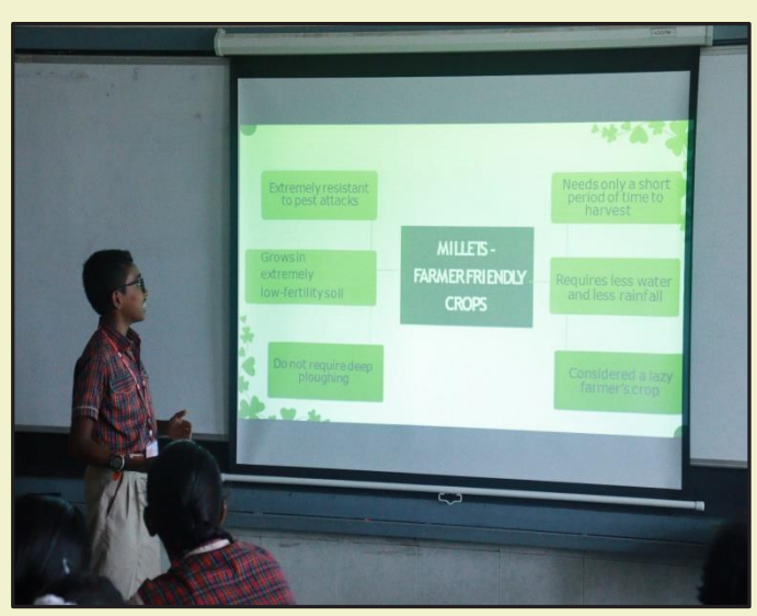
Millets – Farmer Friendly Crops