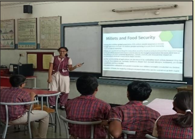
Millets and Food Security