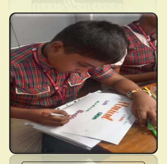
Creator at Work