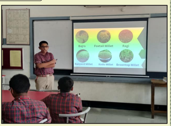
Exploring the Millets and its varieties