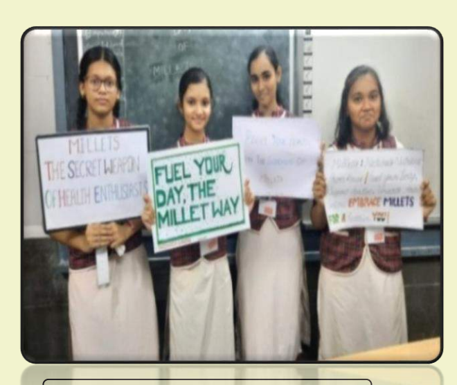
Parade with Placards