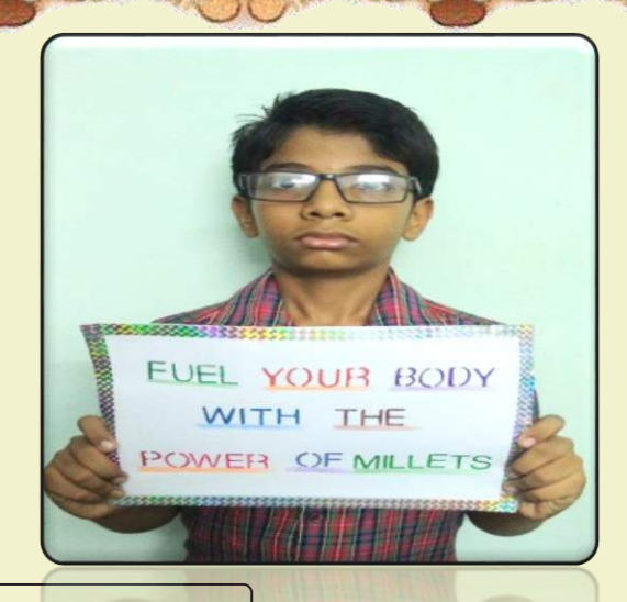
Promoting Millets with Powerful Slogans