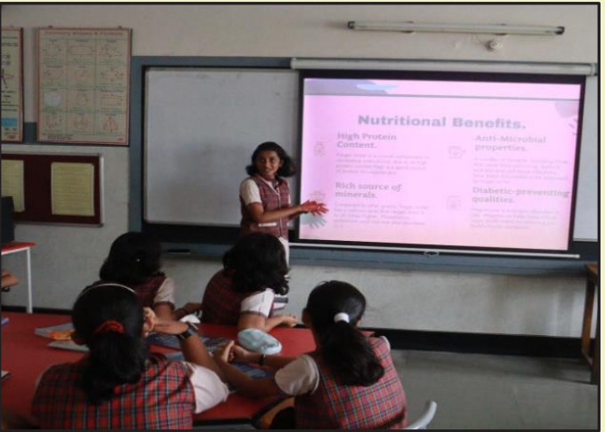
Health and Nutritional benefits of Millets