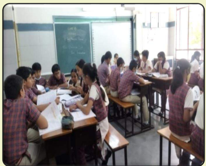
Musing on Magnificient Millets