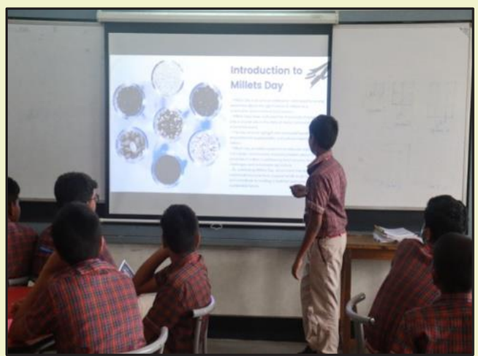
A Foreword to Millets