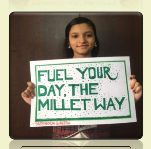
Elegant and Effective