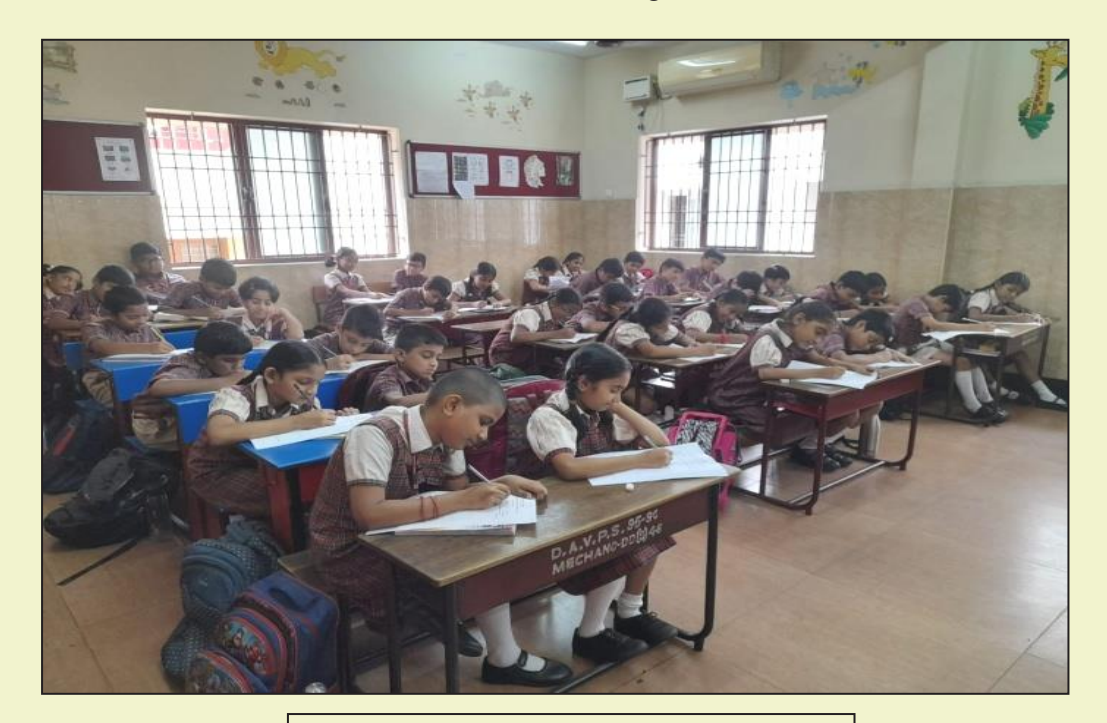
"Puzzle Play"- Where Thinkers Thrive

The International Year of Millets 2023 flared up the students of Grade III & IV to put their best foot forward as we initiated a puzzle on Millets. An awareness about the names of Indian millets was already created through Vocabulary Drill. A special emphasis was made on the health benefits of the nutritionally superior millets prior to the activity. We realized the success of this activity when students asked about the food items that can be made using millets.