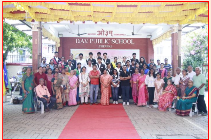
Picture Perfect Moment for the Parents, along with the Principal and the Student Council Members