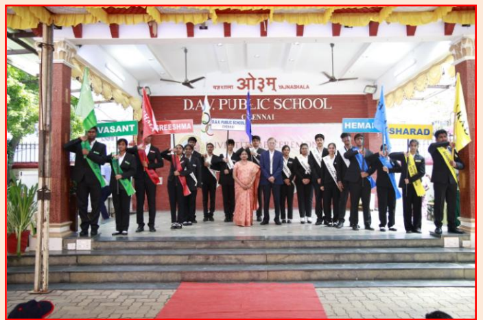
The Student Council Members inducted into the Council