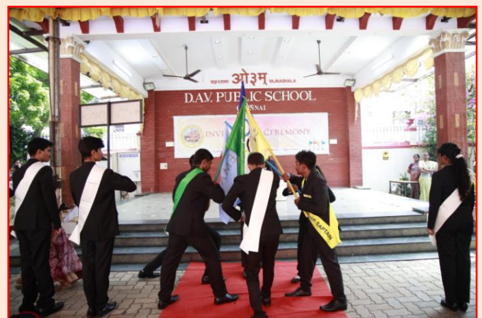
Oath Taking Ceremony