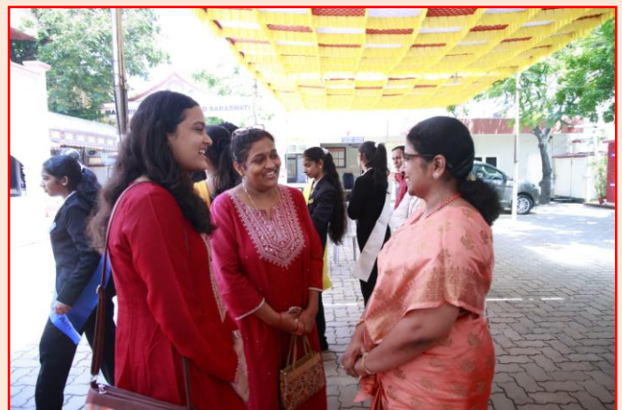
An Informal Networking with the family of Student Council Members