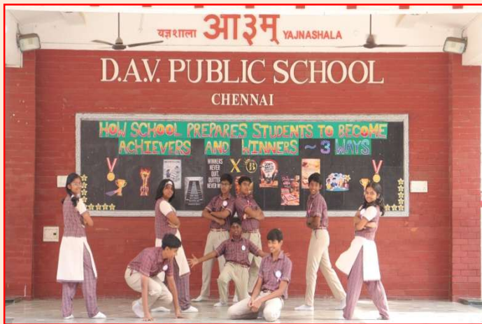
Rhythm of Rise - Dance ‘Dream Big, Fly High, the World is Yours’