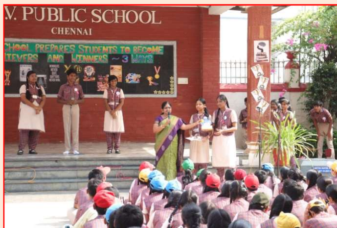
Principal’s feedback – ‘School is the First Step to Success. We don’t just teach Subjects, We Build Character’