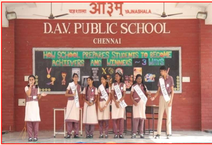
From Potential to Pinnacle – A Skit ‘The First Training Ground for Life’s Battles’