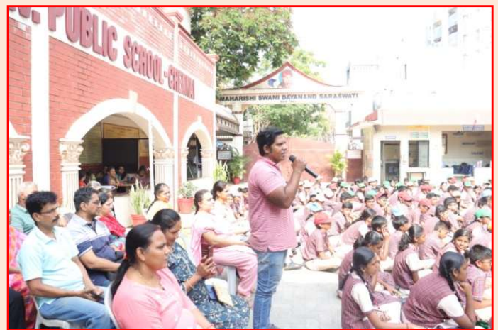
Parent’s Feedback – ‘School Routines, Activities and Values Prepare Every Child to Become Winners and Achievers’