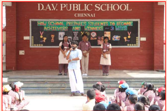
Alumnus Feedback on the Assembly – ‘School made me What I am Today’