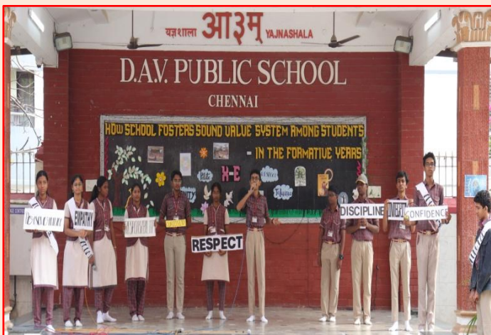
The School of Values – Nurturing Discipline and Skill focus