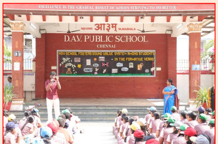
A Throw Back - Alumnus