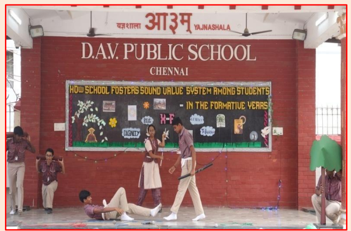
Building Conscientious Citizens by encouraging Self Defence