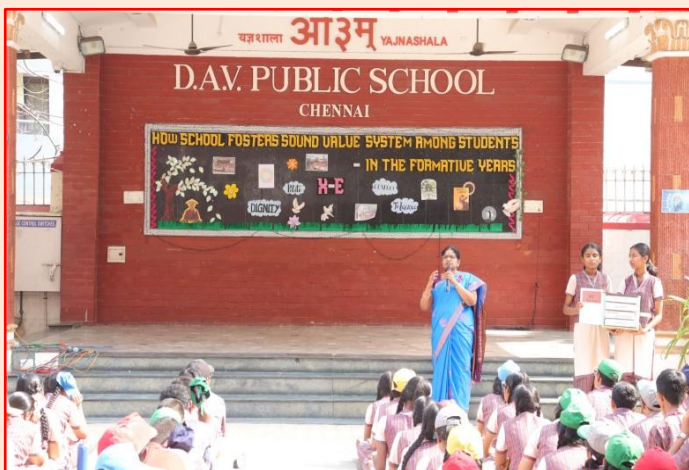
Words of Treasure – A Positive Reinforcement