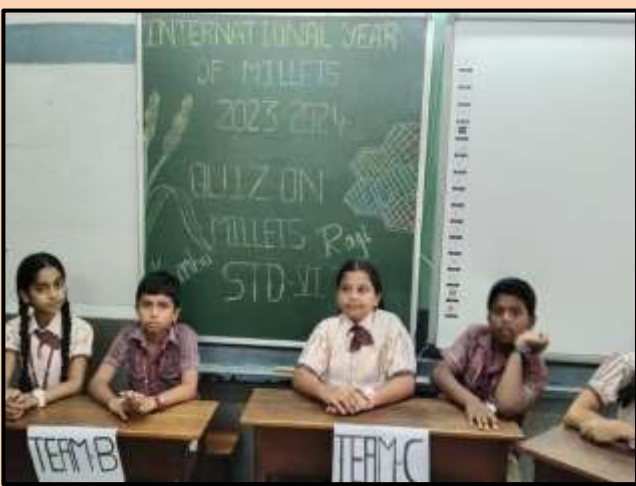
Whiz Wizard Showdown