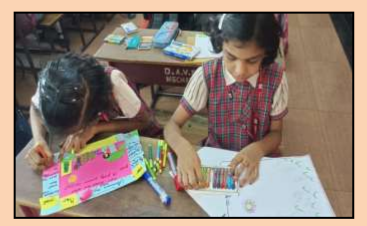
Students transforming millet field into a masterpiece

This hands-on experience provided a unique opportunity for students to learn about the importance of millet cultivation and its role in ensuring food security. It helped foster an understanding of the significance of traditional crops in our diverse agriculture. Overall, it was an enriching and educational experience that allowed young artists to explore the beauty of the millet fields through their artistic lenses.