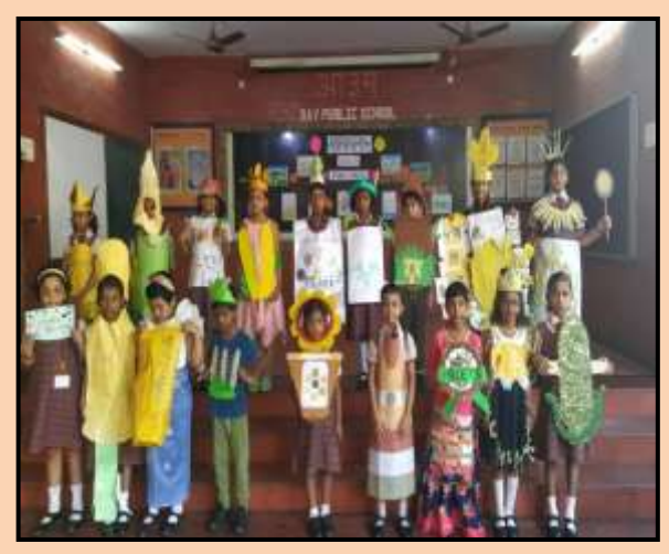
Dressed in Millets: Sprouting seeds of creativity