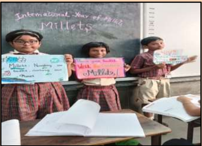
Poster making – "Discover the Power of Millets" by students Std. V Std. VI, VII, VIII