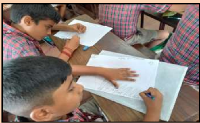
Students adding vibrant colours to their art work