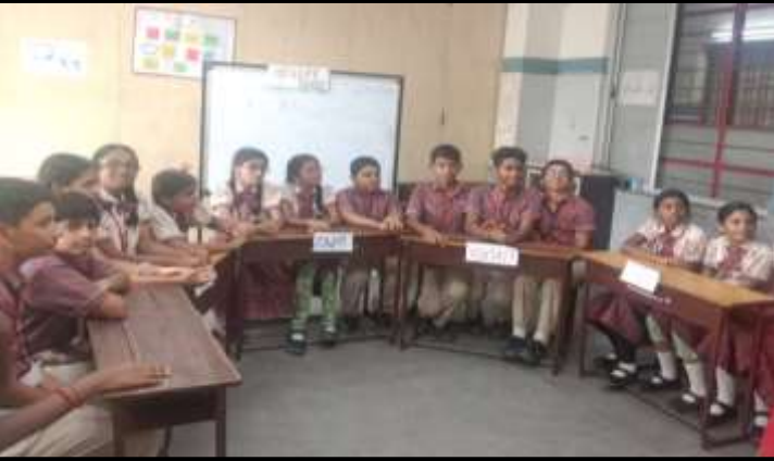
Students of Std. VII Compete to ace the Quiz Competition