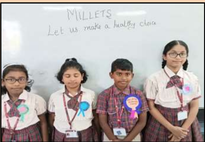
"Revive your health with the goodness of millets" – Let us make a healthy choice messages by Ambassadors of Std. V