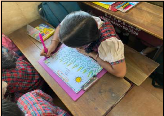
STD. V to VIII