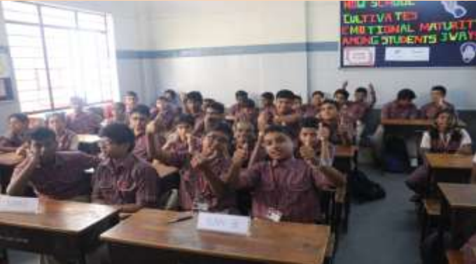
The Final Scores And The Jubilant Winners of Std. VIII