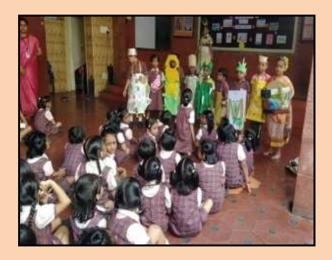
Exploring Nature's Wardrobe: A Millet Extravaganza

In commemoration of International Year of Millets, our School organised a fancy dress event where the students of classes I and II were encouraged to dress up as any millet of their choice. Students demonstrated their commitment to promoting awareness about millets in a visually appealing manner. The students expressed confidence and creativity in their theme based millet costumes, making the event not only entertaining but also educational. The event succeeded in fostering a sense of appreciation among the audience for these nutritious grains, leaving a lasting impact on both participants and spectators.