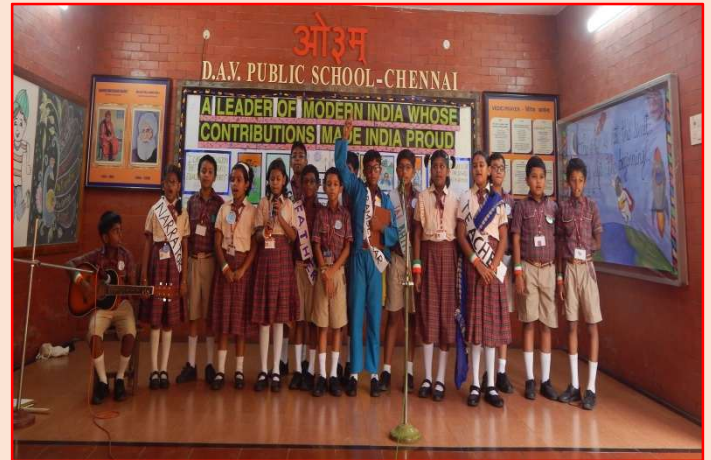
‘Voicing Equality through Every Note’