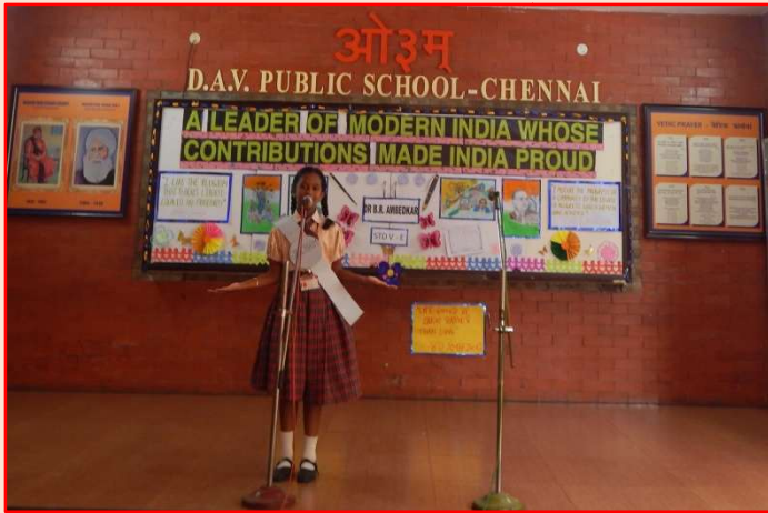
‘Welcoming Minds’ – A Prelude to Ambedkar’s Powerful Legacy