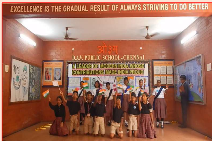
‘Dance Extravaganza’ – Steps that Salute Babasaheb’s Legacy