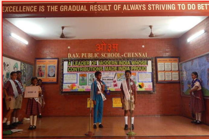
‘From Struggle to Strength’ – Ambedkar in Action