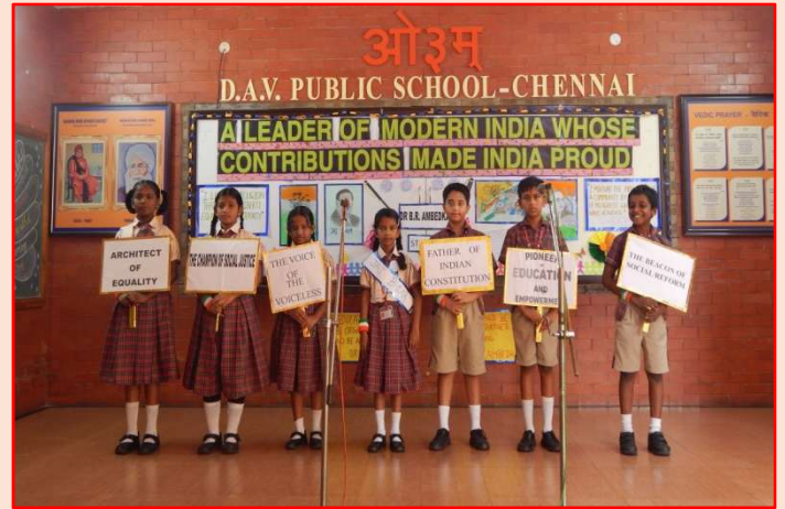
‘Echoing Ambedkar’s Vision’ – A Tribute in every Syllable