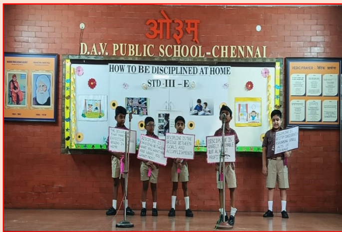
Discipline: The Path to Excellence