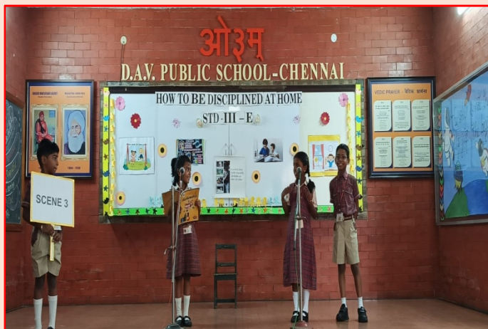
The Power of discipline at Home