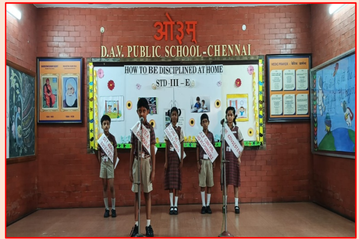
Mastering Discipline at Home