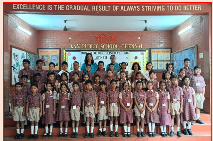
Moments captured, Memories forever