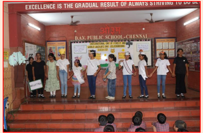
Nature Heroes on the Ramp