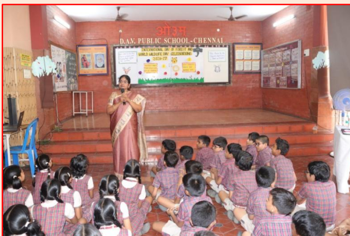
Words of Wisdom from the Principal