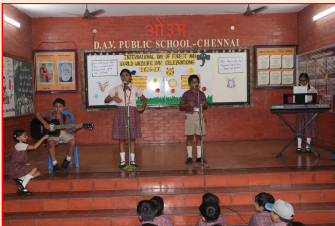
Harmony with Nature