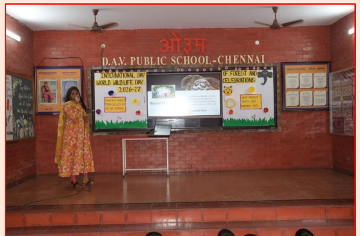
Chief Guest's Address on Forest & Wild Life Conservation