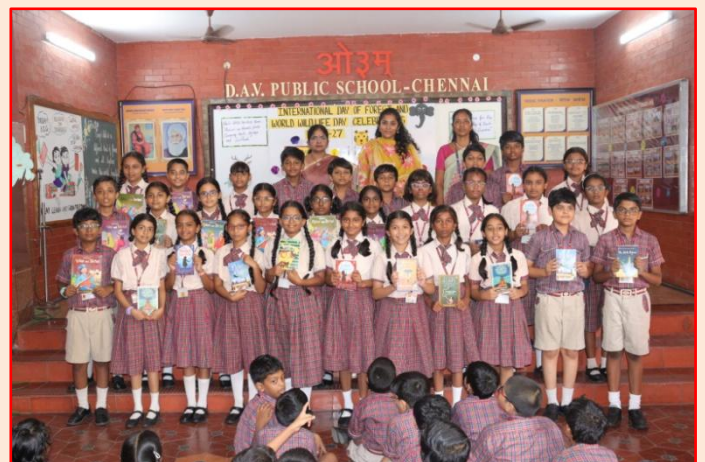
Recognising Young Achievers