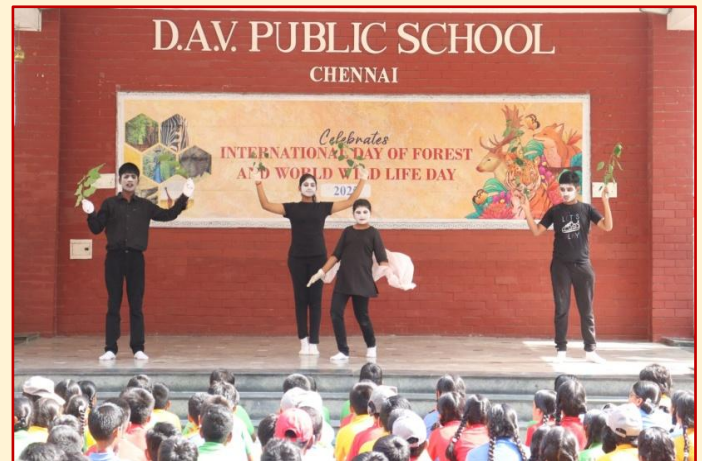
Students at Act – Voice for the Trees & Animals