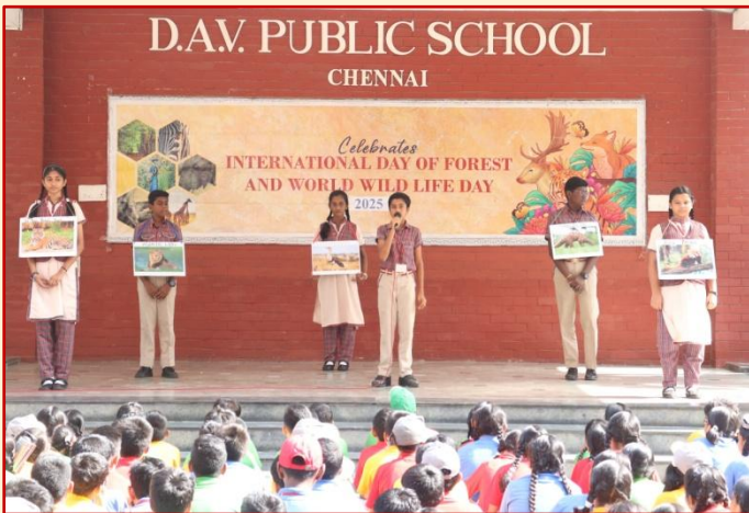
Echoes of Extinction