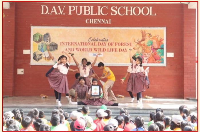
Nurturing Nature through Action