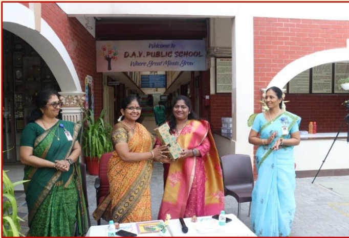
A Moment of Honour – Principal Welcomes the Chief Guest