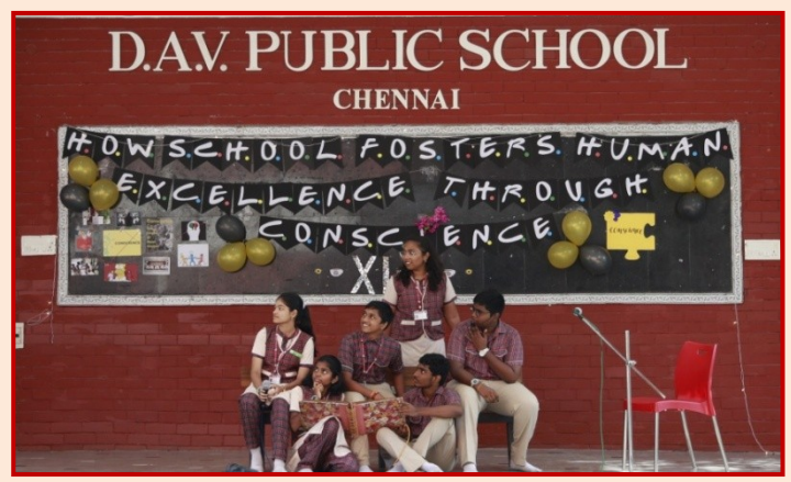
'Role Play' - The One with the D.A.V Yearbook