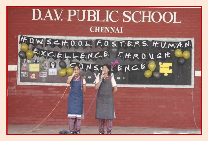
Heart Warming Poetic Welcome Address