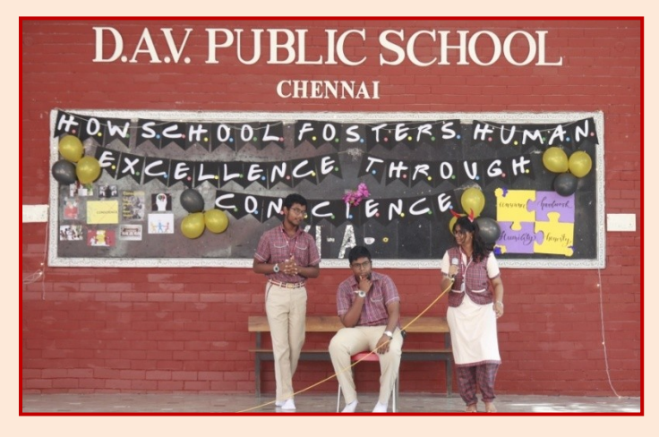
'Decision Making' – Let Conscience be Your Guide