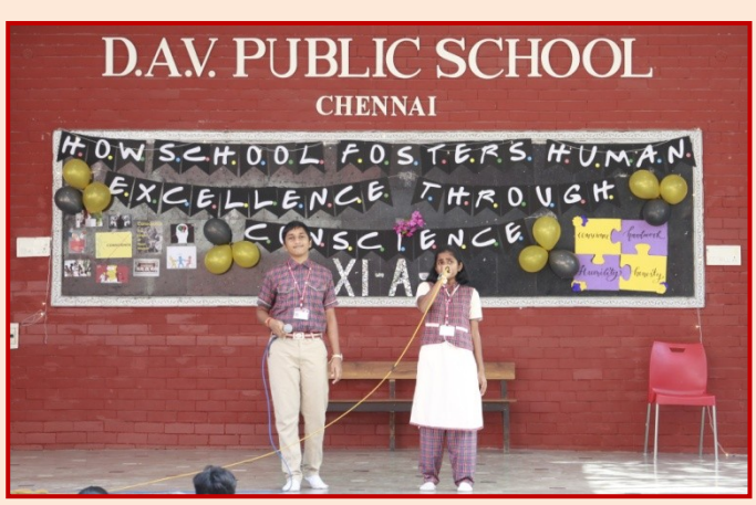
'Talk Show' - A Peek into School's Activities