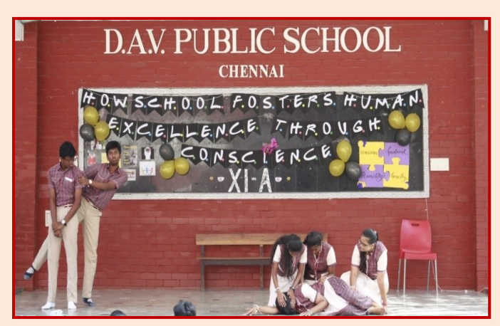
Thematic Dance Performance