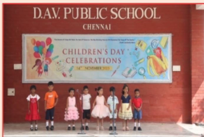
Our Little Models stealing Every Heart