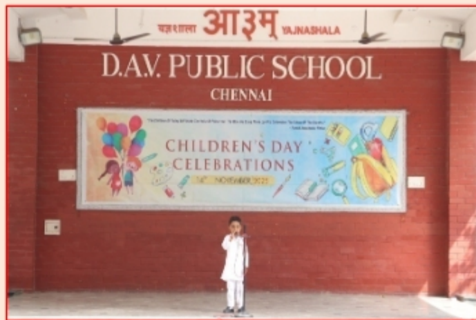
Small Speaker, Big Confidence