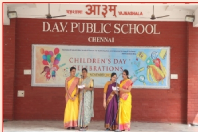
Our Teachers spreading Joy through Music