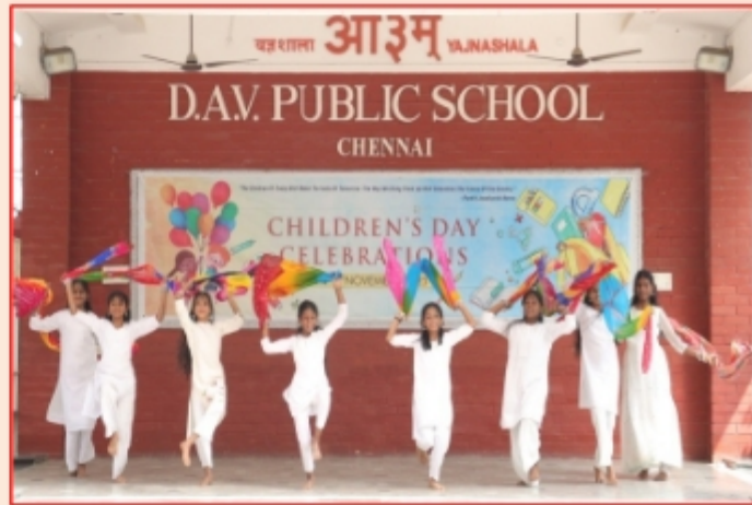
Elegance in Every Step