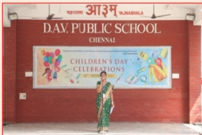
An Insightful Speech by the Faculty