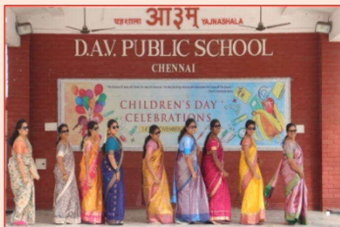
Joy in Every Step – Teacher's Special Performance