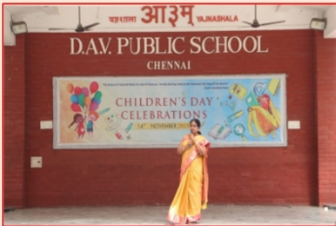
An Inspiring Address by our Principal Ma'am