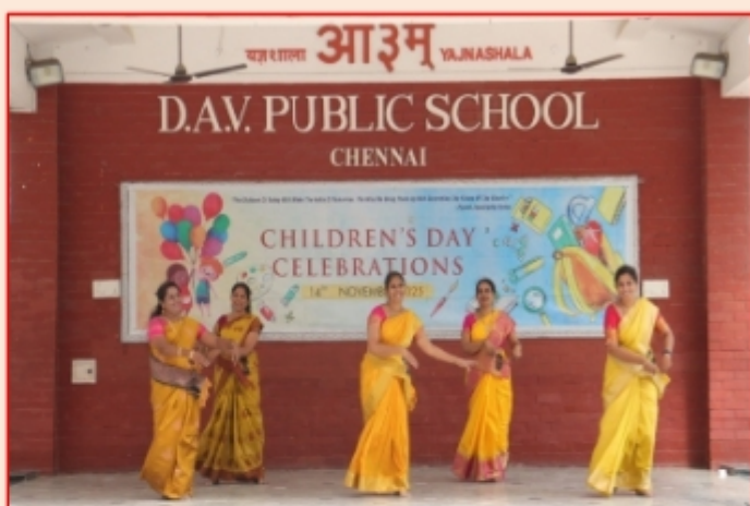
Teachers step in Style and Kids cheer with smiles-making Children's Day sparkle with fun!