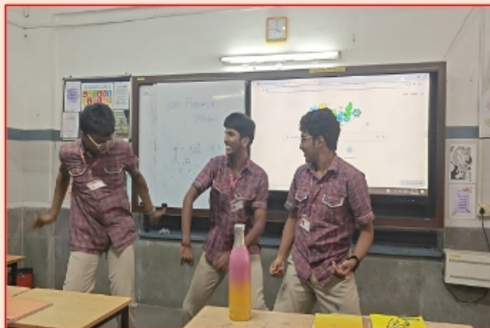
Joyful Grooving to the Musical Beat