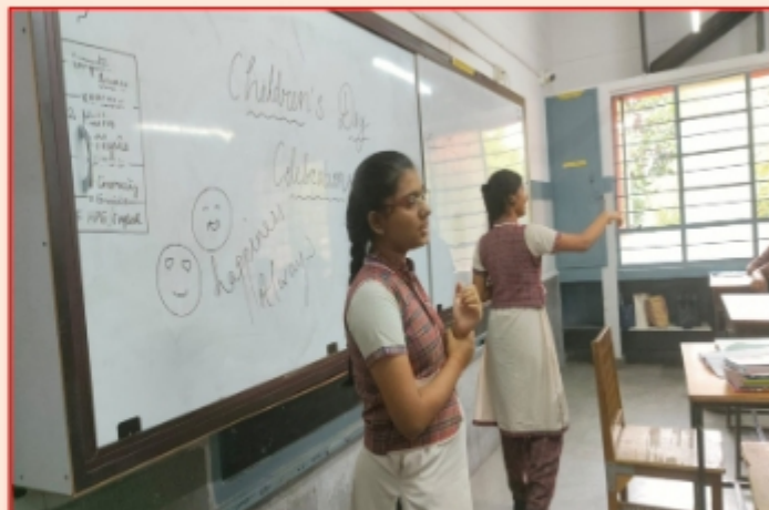
A Lively Activity Showcasing Students' Creativity