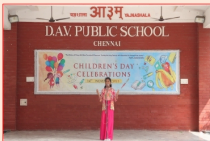
Speaking with Purpose and Pride