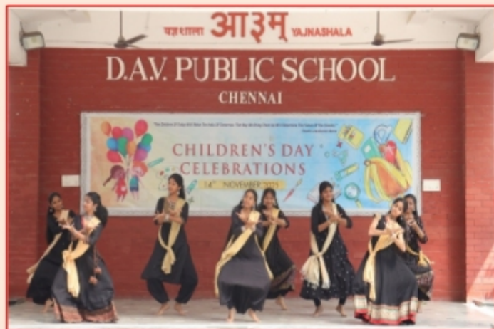
A Commendable Performance that added Charm to the Event