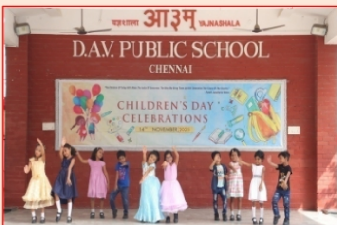
Dancing their way into our Hearts