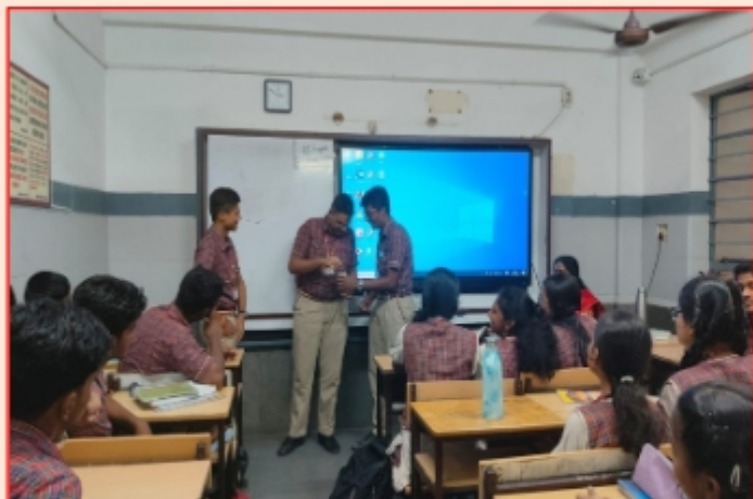
Exciting Fun Games and Activities Conducted by Student Council