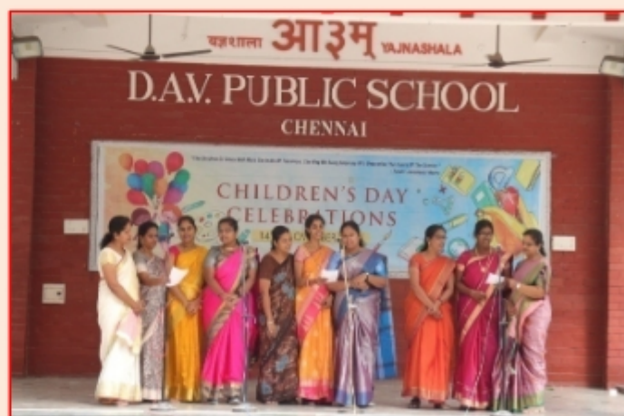
A Melodious gift from the Teachers