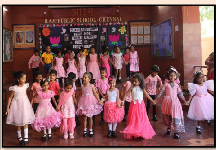
Together We Dance like the Lotus Flower