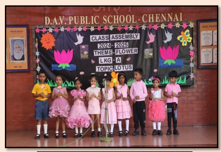
Little Stars Shining Bright Starting the Day Just Right