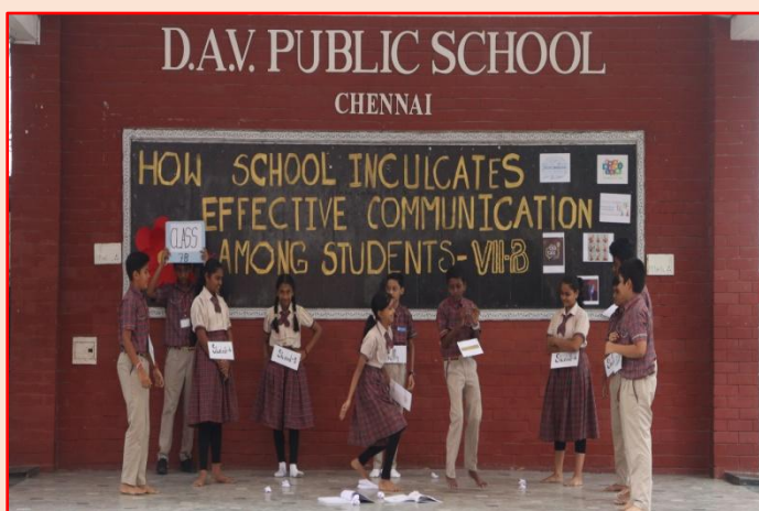
Talk Show on Effective Communication