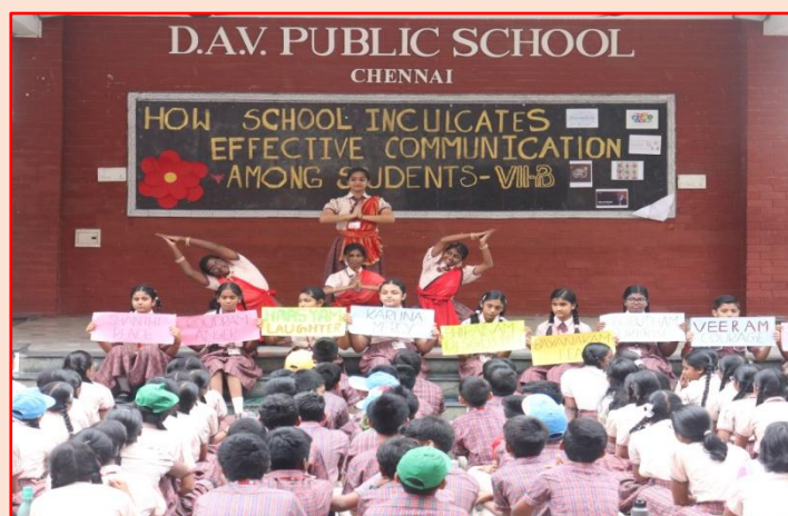
NAVARASA NATTIYAM – Significance of Non-Verbal Communication