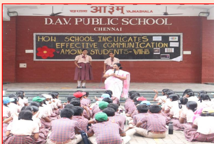
Feedback from Supervisory Head