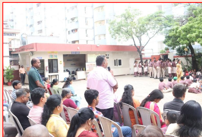
Appreciation from Parents