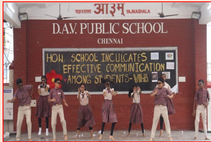
Celebrating Victory through Western Dance