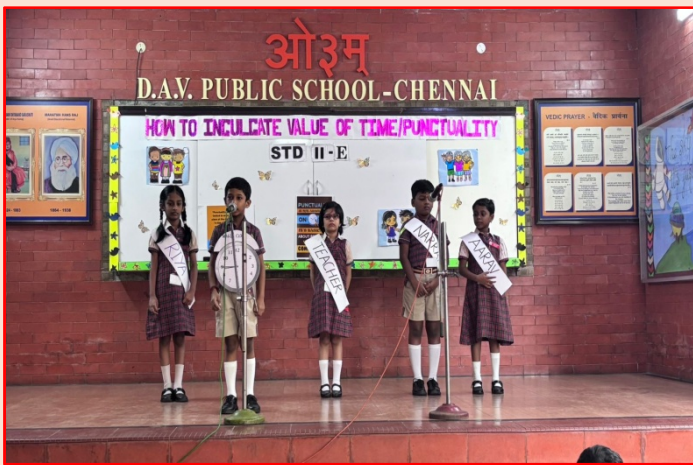
Tick-Tock: The Story of Time