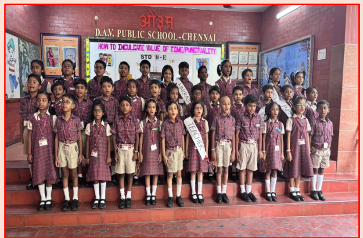
Young hearts united in reverence and faith