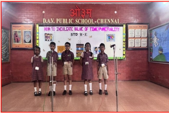
The Power of Punctuality