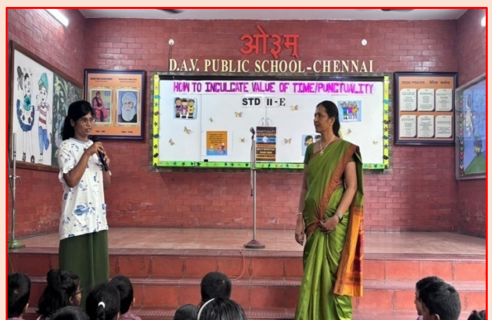
Moments of Recognition and Appreciation