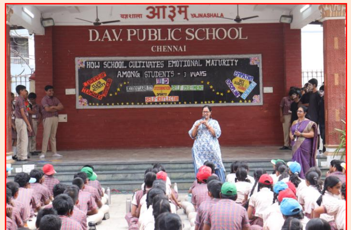
A Parent adding her reflections on the performance of the students