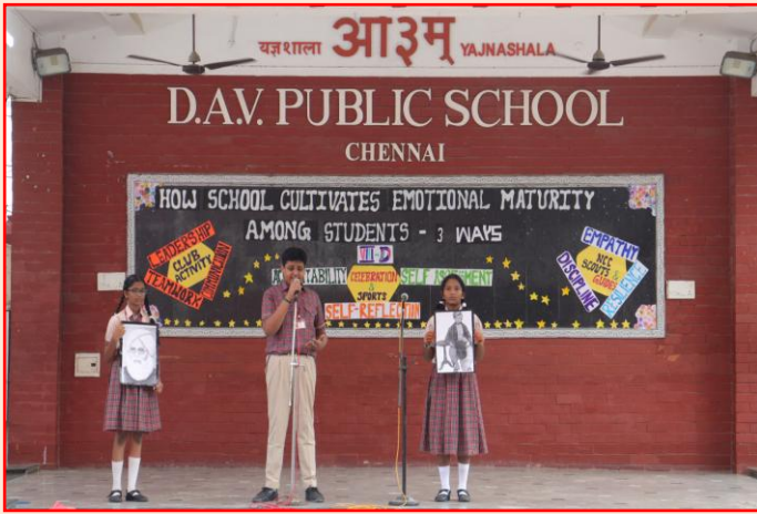
‘The Story of DAV Institutions’ Unfurled