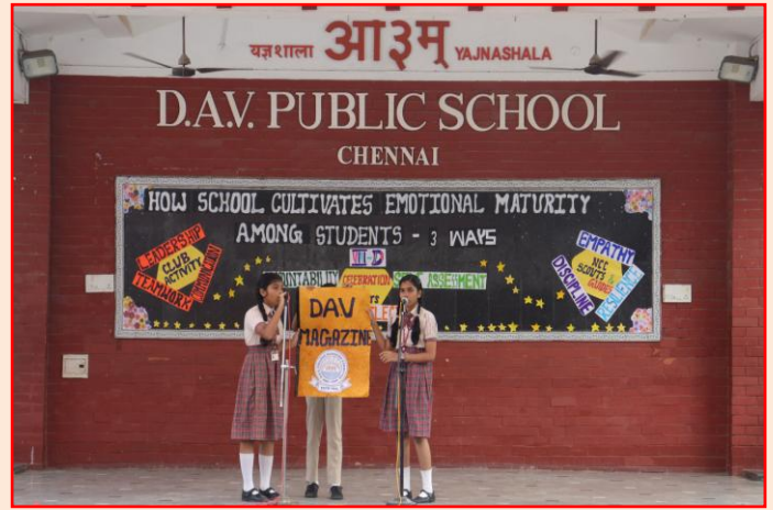
DAV Magazine Designed by the Chennai DAVians