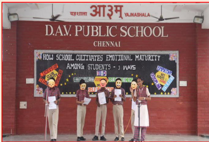
Display of ‘Different Emotions inside a Classroom’