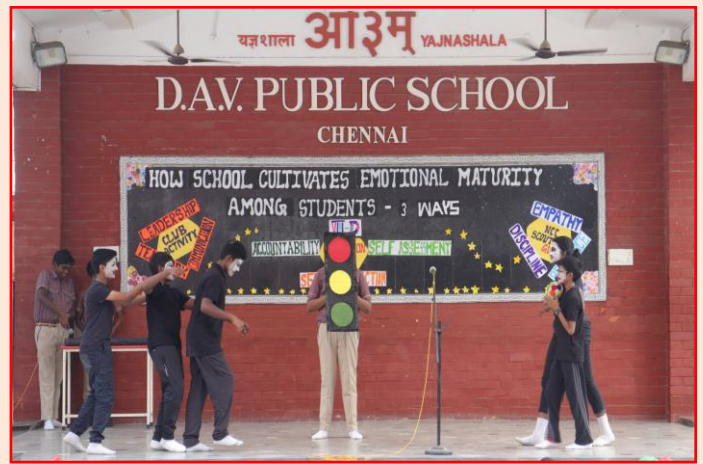
Awareness on ‘Road Safety’ by NCC, Scouts & Guides