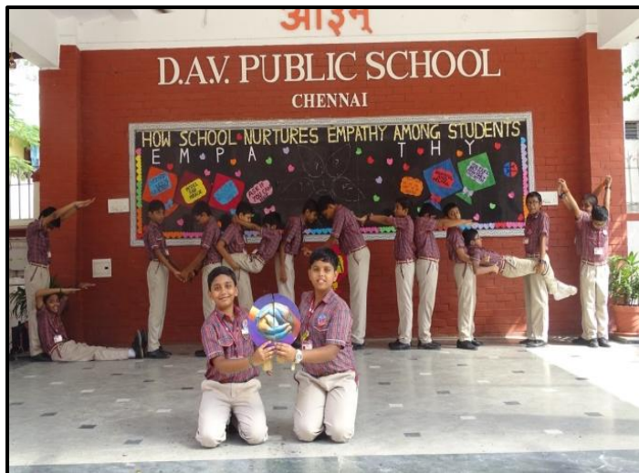
Formation of the word 'EMPATHY' by the Students