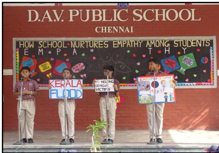
Its all about Empathy