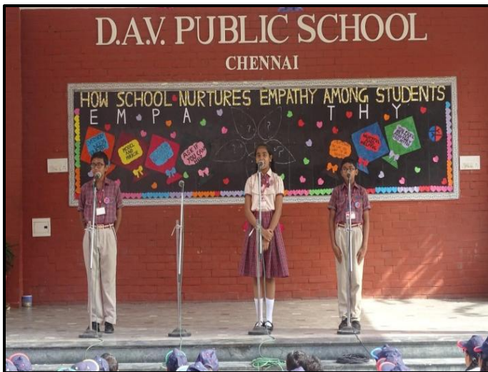
How School Nurtures the feeling of Empathy among students