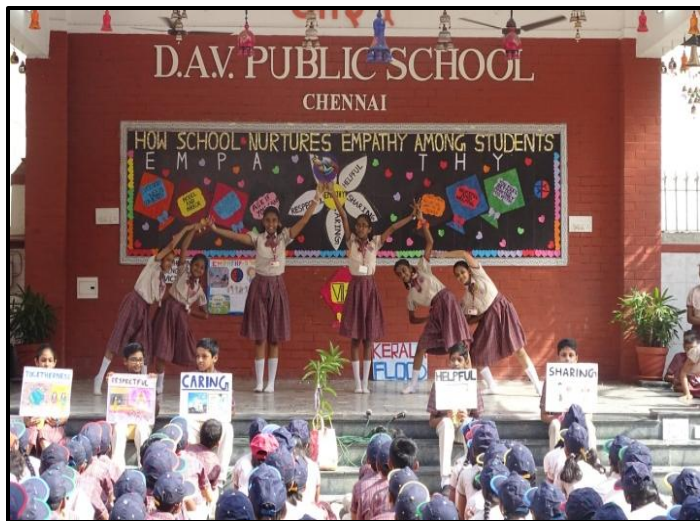
Understanding the meaning of Empathy