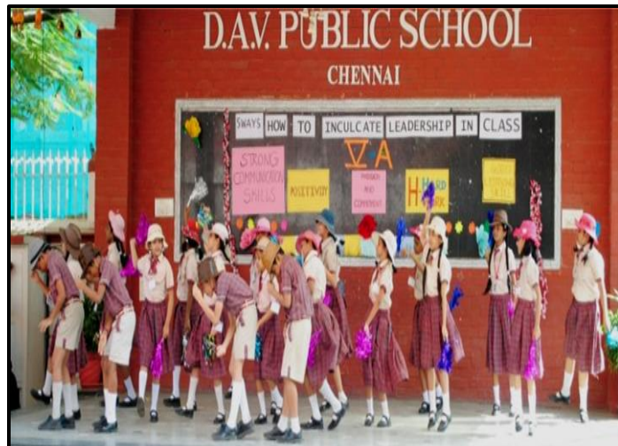
Hitting the stage with a powerful performance on "Leader In Me"