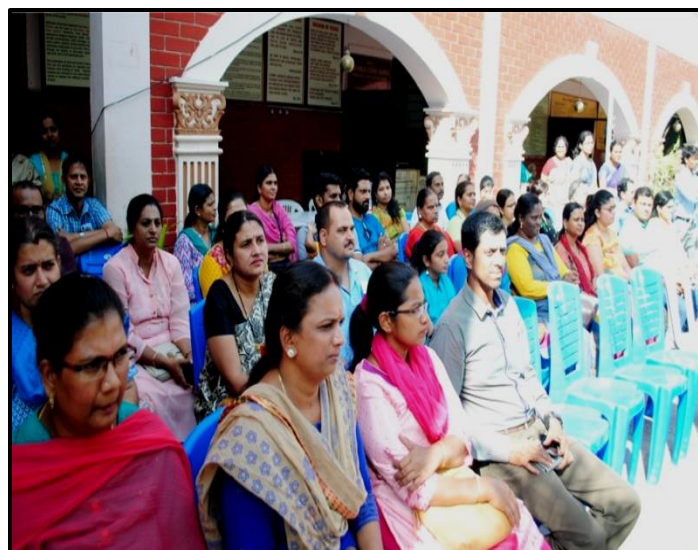
Parents enjoying their ward's performance