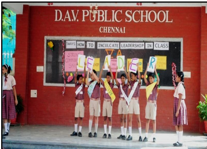
Showcasing the vital qualities of a True Leader