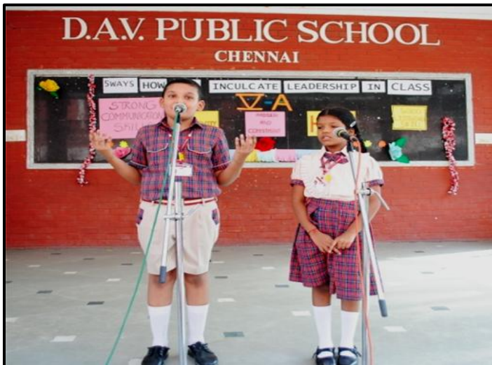
Expressive Introduction of the theme Multi Linguistically