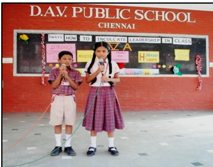
Expression of Gratitude