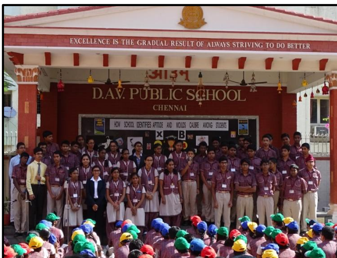
Singing in Unison – ‘Never Say Never’