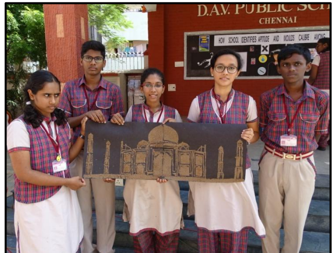
Creative Fingers – Sand Art