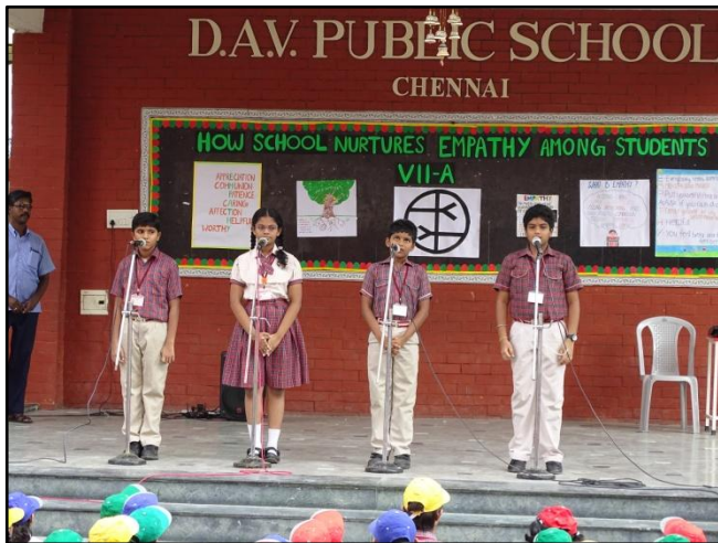
Skit – “Need of the Hour”, How a person understands others problem and shows empathy