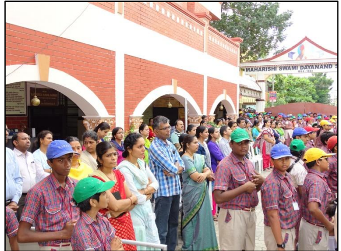
Awestruck Parents during the Assembly