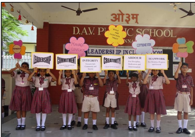
The values of a Leader – Commitment, Integrity, Creativity, Adour and Teamwork