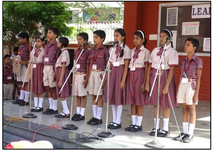
D.A.V. Gaan being Sung by Students of Std. V D