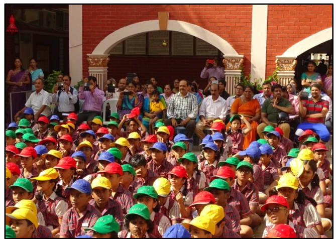
The enthusiastic Parents and Students