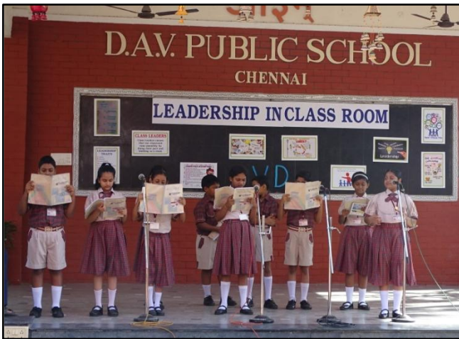
Class monitor develops each one of them as a "Voracious Reader"