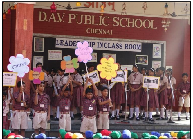
Leadership Qualities are displayed