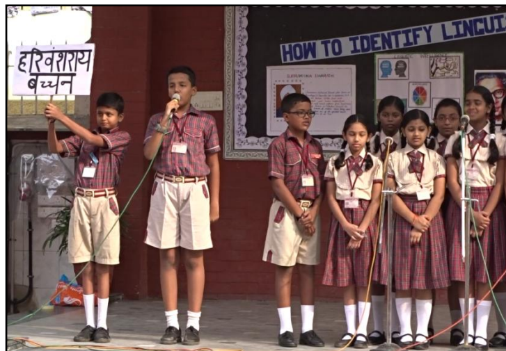
Speech in Hindi on the great poet Harivansh Rai Bachchan