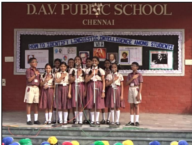
Hindi song on famous personalities shining star of Indian Culture.