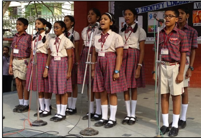
D.A.V. Gaan and prayer for seeking God's blessings.