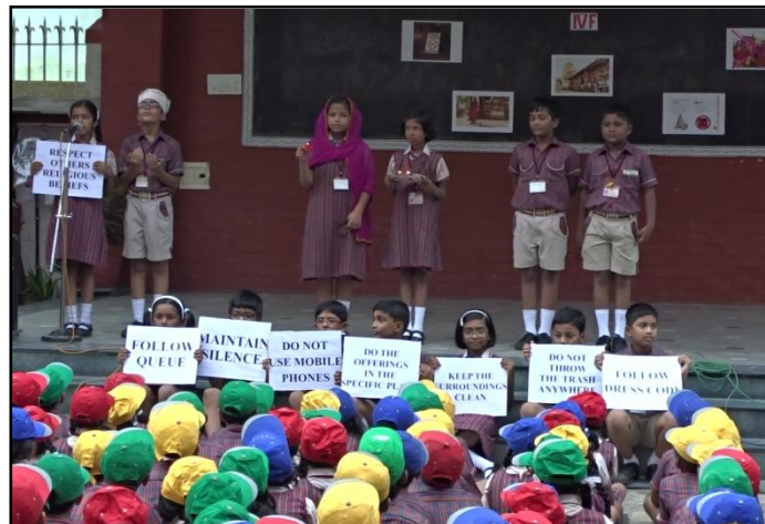
Role Play – Respect Others Religious Beliefs