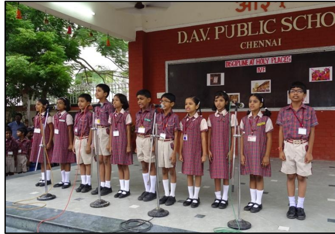
D.A.V. Gaan being Sung by Students of Std. IV F