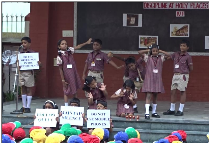
Role Play – Do the Offerings in the Special Place