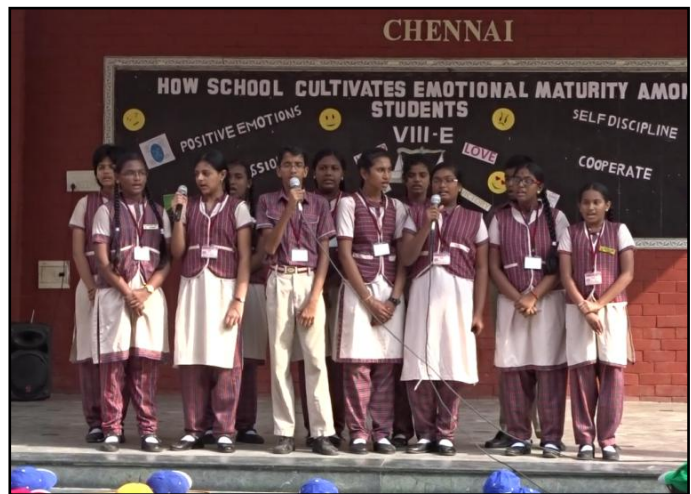
“A Bharathiyar Song” on expectation from Students