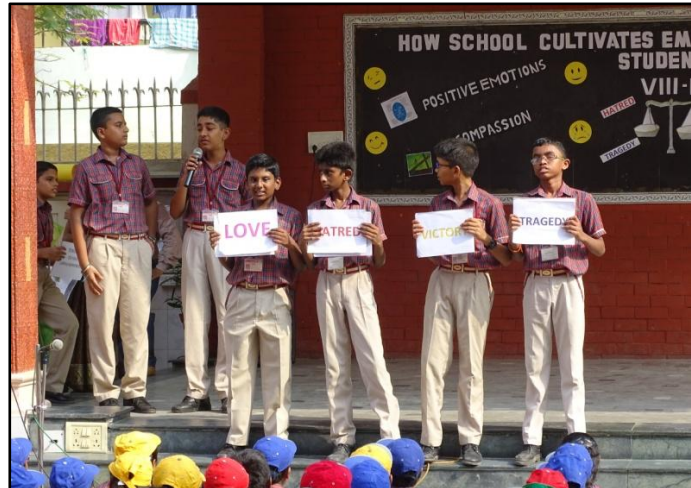
Expressing the views on Emotional Maturity