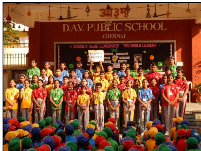
A Motivational Song – 'Believe in Yourself'