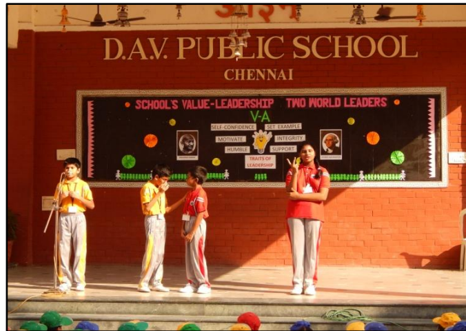
An inspirational story from Gandhiji's life – "Breaking the sugar habit".