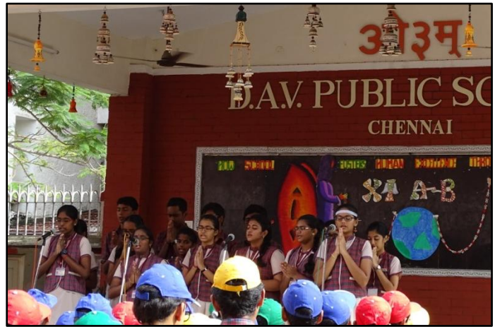
Gayatri Mantra being sung by the Students