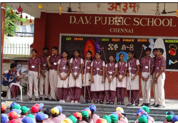
Song Sung by Students