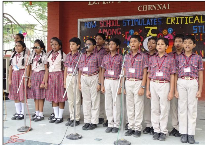
SCHOOL'S MISSION - How school stimulates Critical Thinking among Students