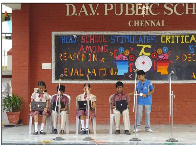
Students enacting on Logical Reasoning Skills