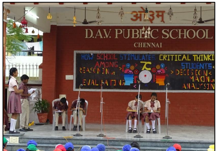
Students enacting on Evaluation as a contested practice