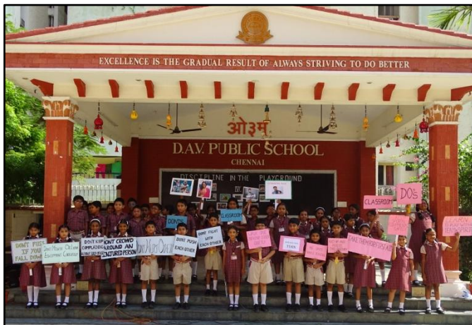
Do's and Dont's of Disciplined behaviour