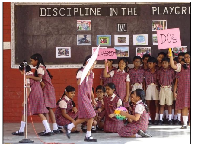
Skit - Handling injured Student in Play Ground