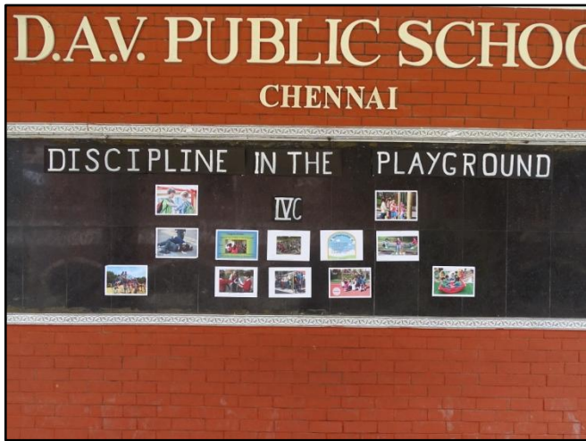
SCHOOL'S VALUE - How to be Disciplined on the Play Ground