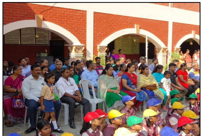
Motivating and Encouraging Parents