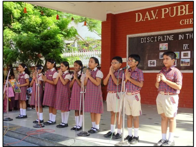
Recitation of Ishwar Stuti Prathna Upasna Mantra