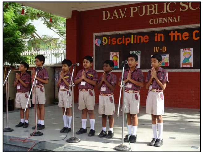
Recitation of Ishwar Stuti Prathna Upasna Mantra