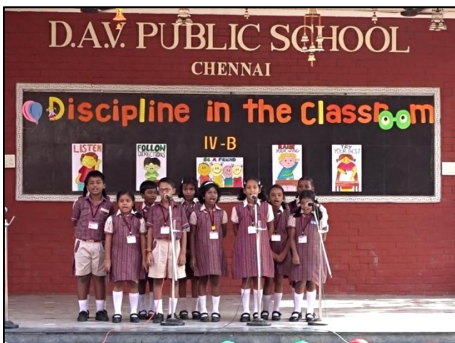
Song – We are the World We are the Children