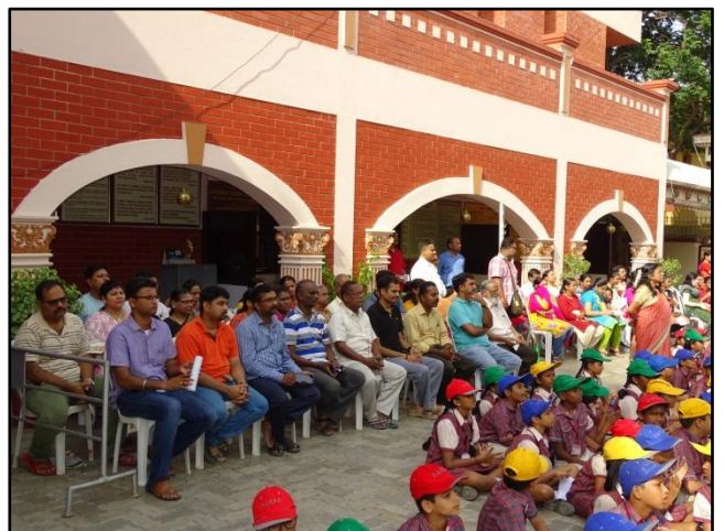
The enthusiastic Parents and Students