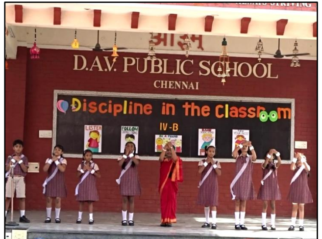
Dance – I can follow the Rules