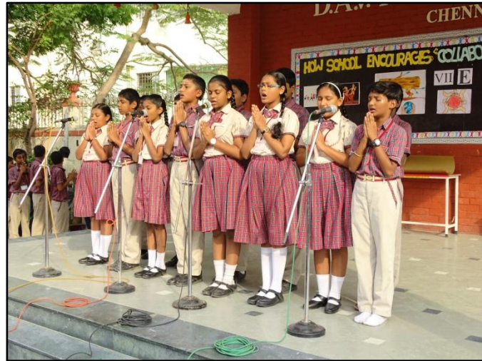
Students invoke the blessings of God