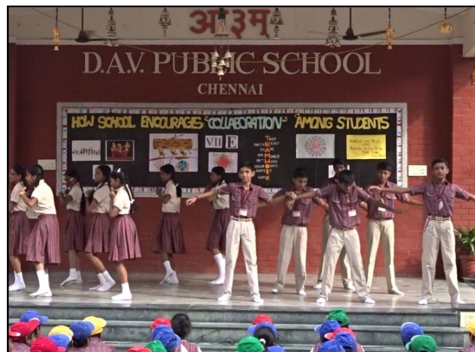
Shake your legs & body for the tune of 'team work'