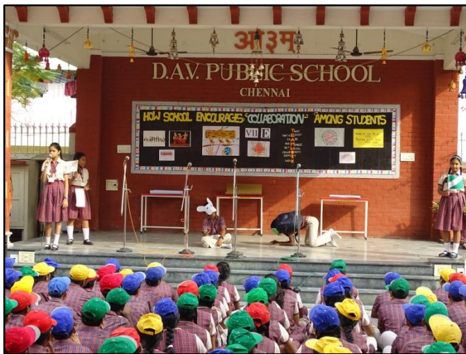
'Hare & the Tortoise' – Coming of age Drama