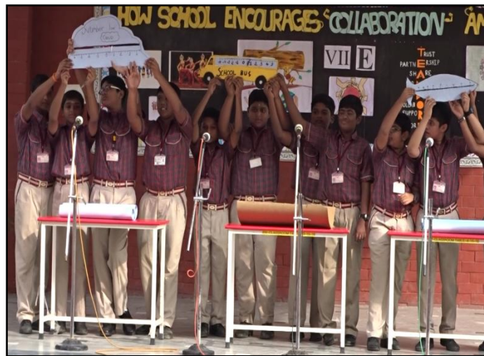
Maths project done in 'Collaboration'