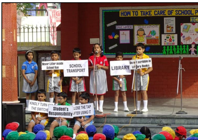
Sharing the importance of maintaining School Transport and Library