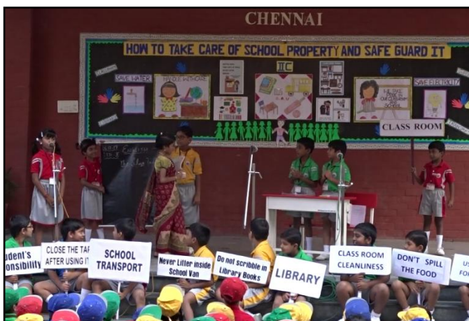
Skit – Depicting the value of School property