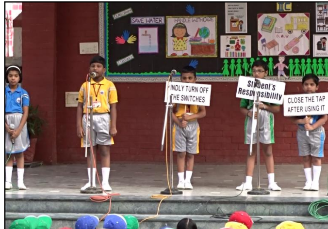
Student speaking on 'How to save Water and Electricity in School