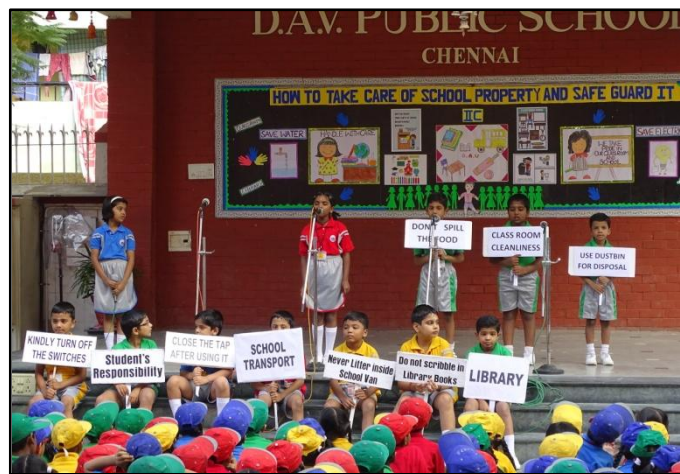
Speaking about classroom rules and responsibilities