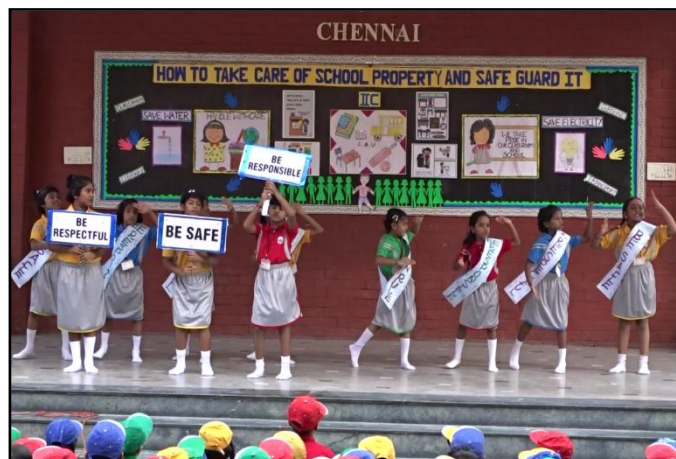
Dance – How to be Responsible, Safe and Respectful