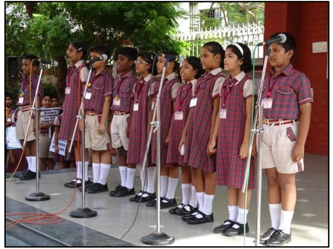
D.A.V. Gaan being Sung by Students of Std. IV A