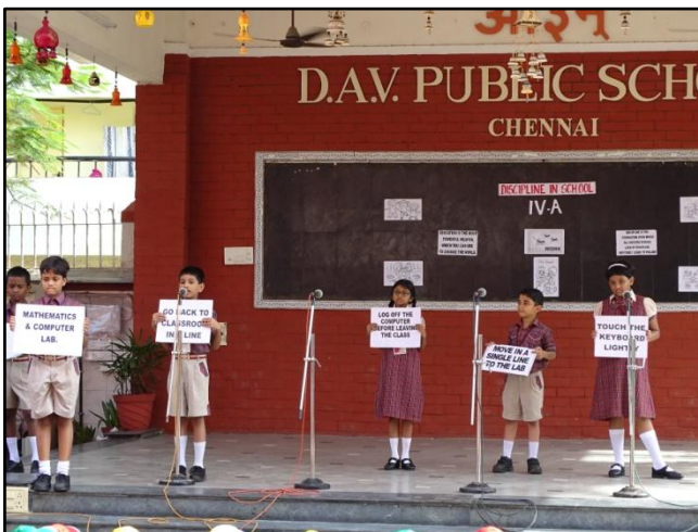
Discipline to be followed in Computer and Mathematics Laboratory