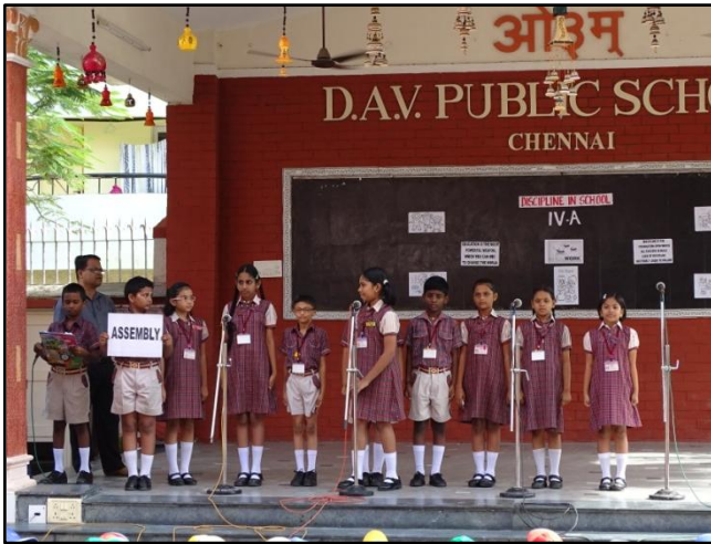
Discipline to be followed in the Assembly