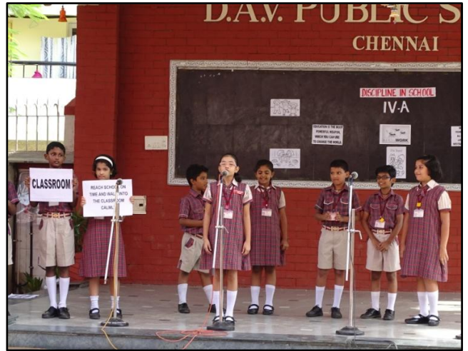
Students Performing a Role Play – Discipline to be followed in Classroom