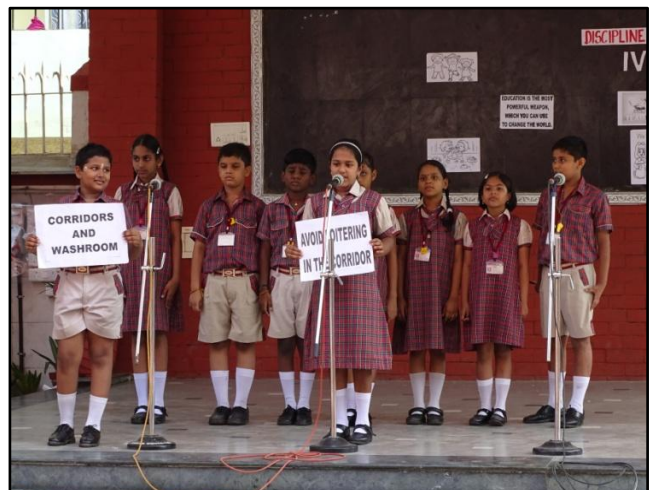
Discipline to be followed in Corridors and Washroom